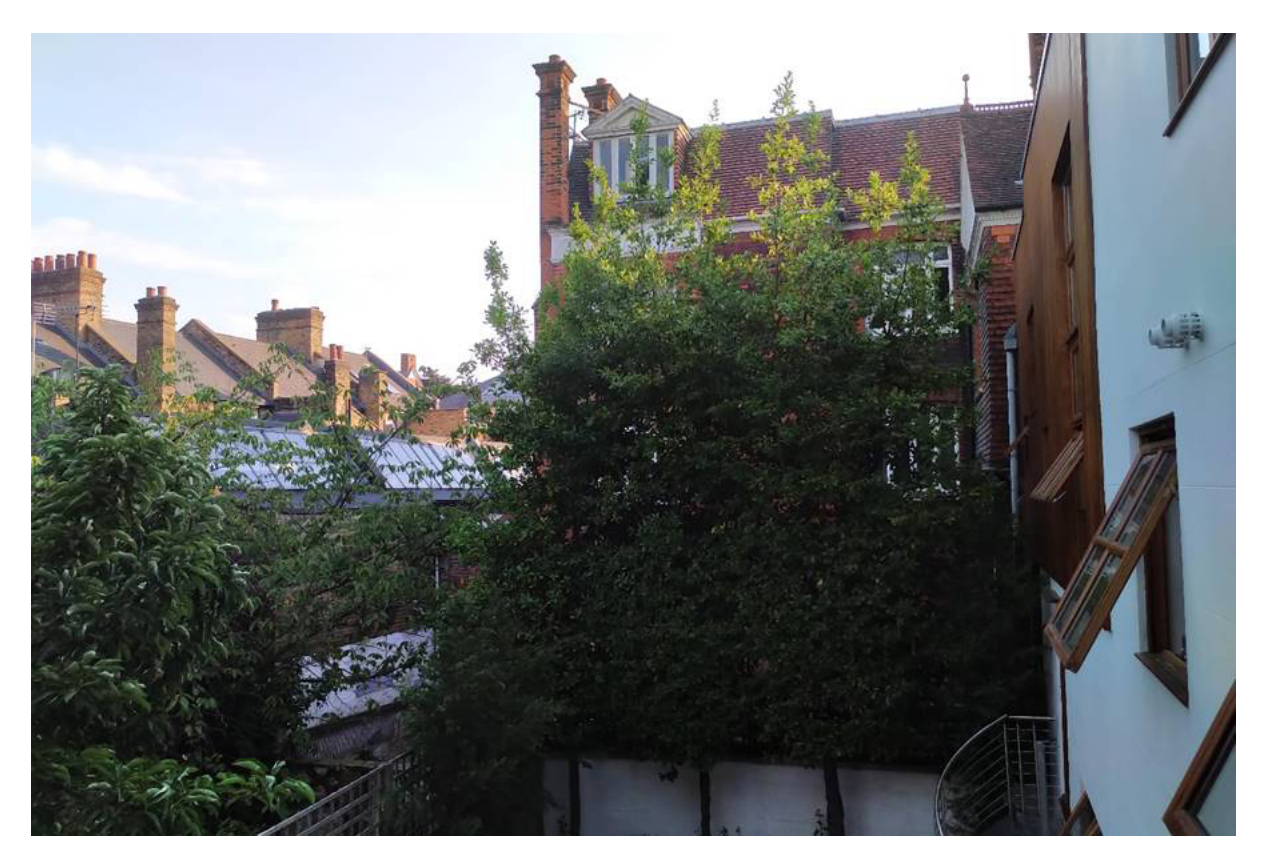
Photo showing range of trees providing shade to the main façade of 8 Pilgrim's Lane, NW31SL. Photo taken on 9<sup>th</sup> August 2020 at 18.00 from 10 Pilgrim's Lane showing 8 Pilgrim's Lane behind the trees, in the right – centre background.

Aside from insulation material, the applicant has also failed to demonstrate how adaptation measures and sustainable development principles have been incorporated into the design and proposed implementation – this is contrary to Camden Policy CC2 paragraph e. Furthermore, as pointed by our consultant, Green Consult Global, in their enclosed report, the overall reduction potential of the property is limited by the use of a traditional boiler rather than employing, for example, a highly efficient heat pump.