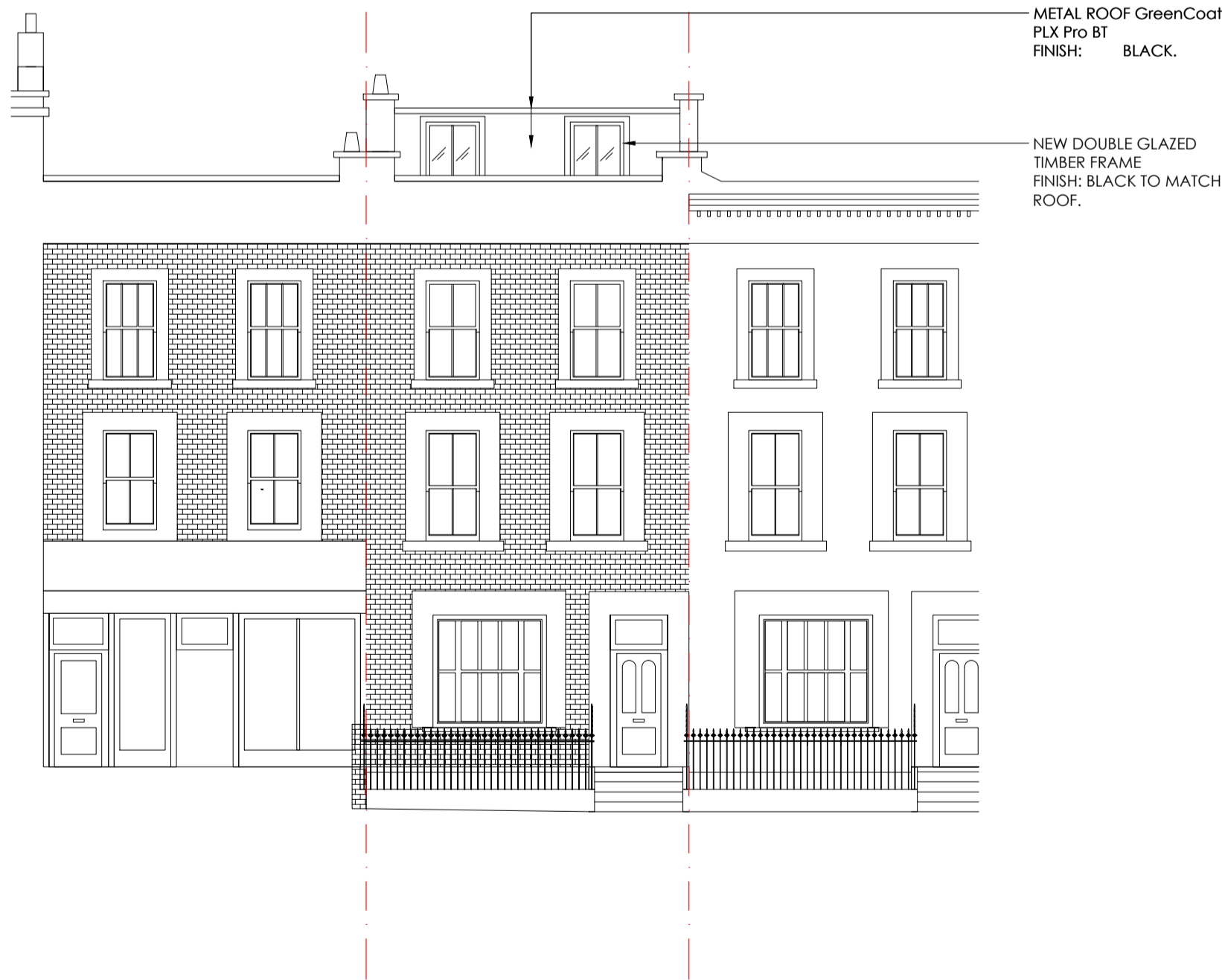
03 PROPOSED FRONT ELEVATION 1:200 @ A3