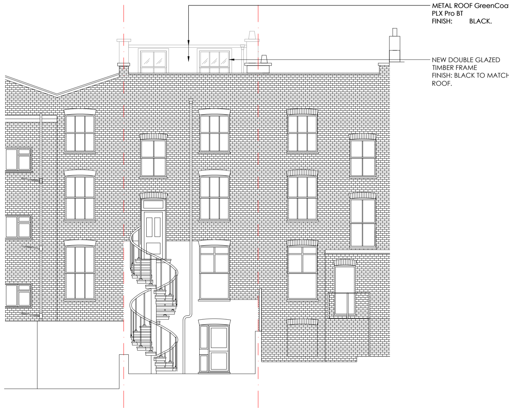
04 PROPOSED REAR ELEVATION 1:200 @ A3

DO NOT use drawing for construction. Used for Design Intent purposes only. DO NOT scale from this drawing. KAL to approve all finishes samples and shop drawings prior to manufacture. All dimensions discrepancies to be reported to KAL prior to manufacture.