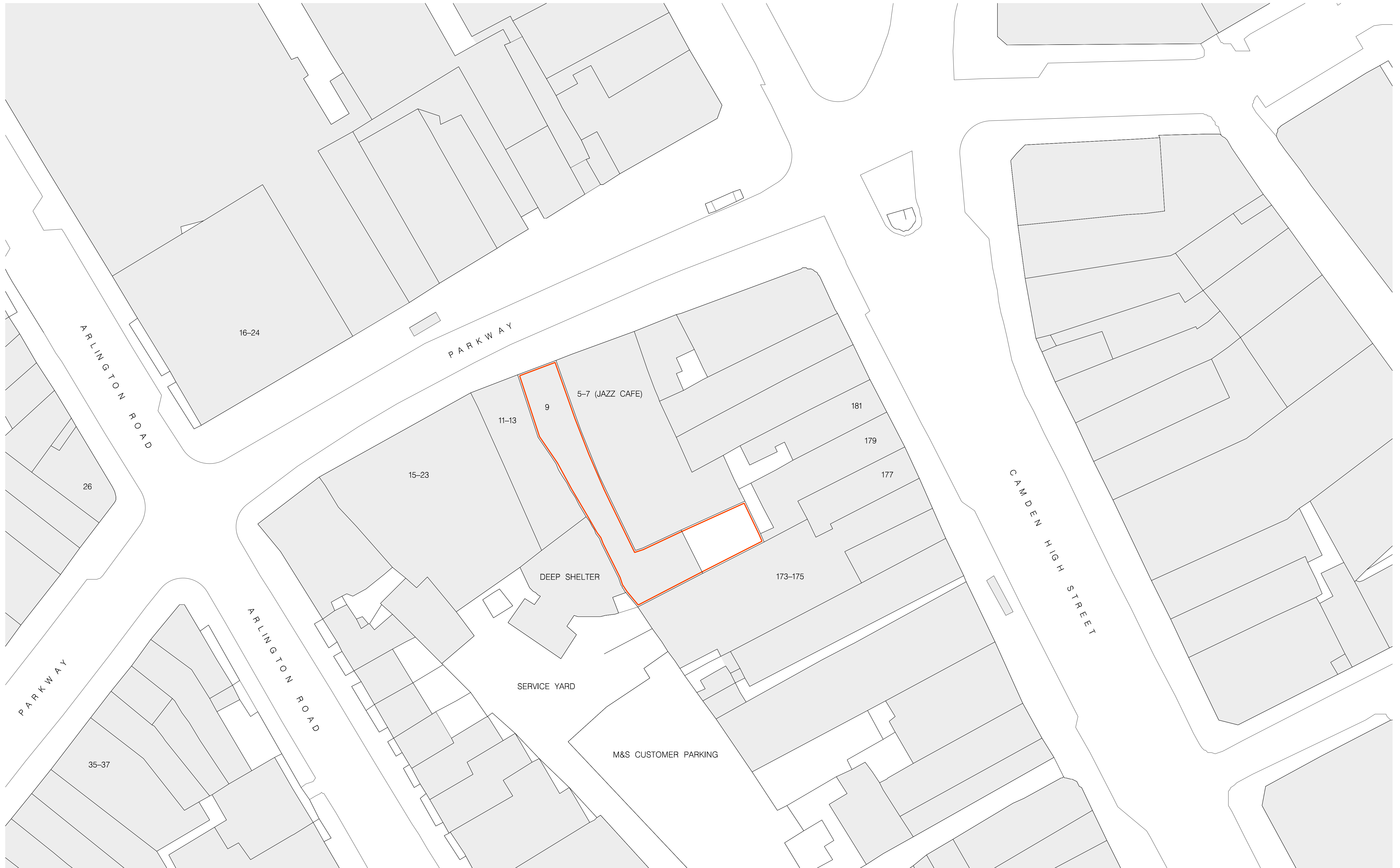
1 SITE PLAN