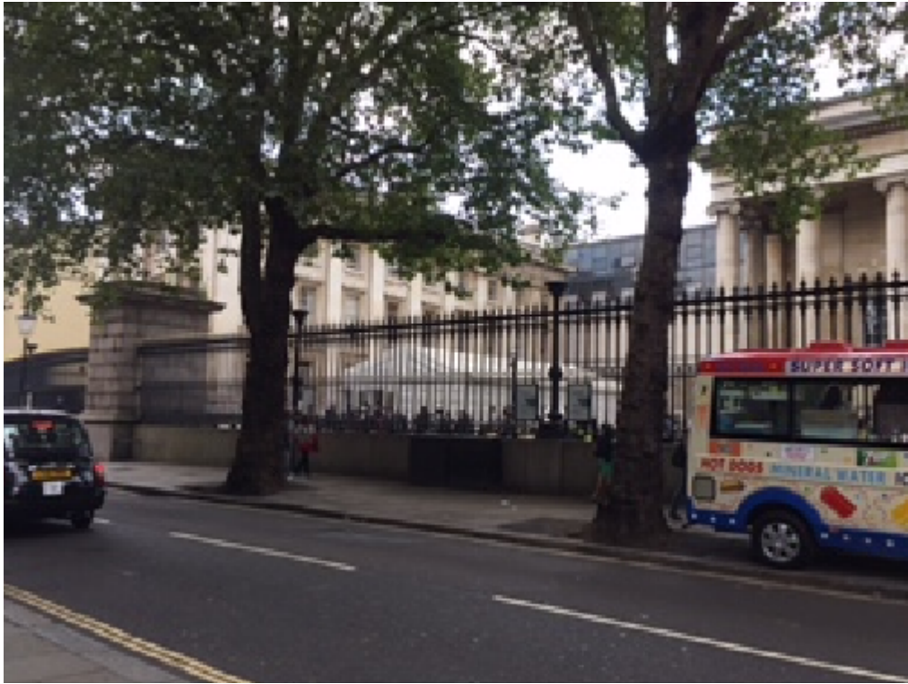
Photo 2: View of the security structure from Great Russell Street looking north