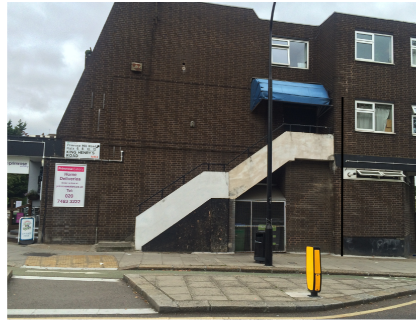
LOCATION A WITH POLE