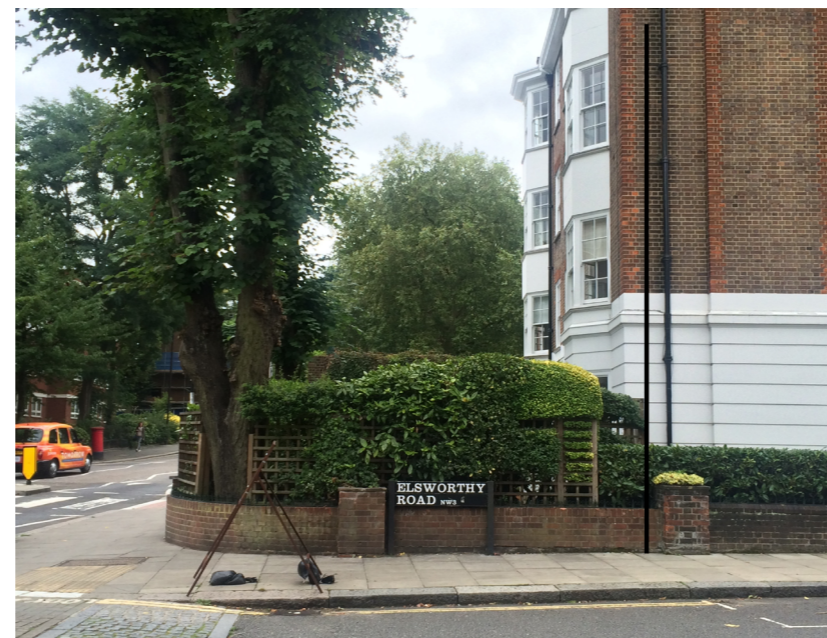
LOCATION B WITH POLE