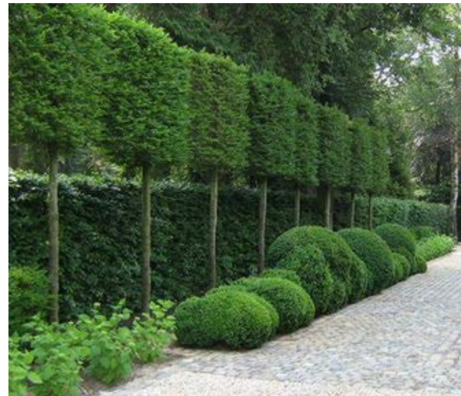
Example image of proposed boundary treatment - hedge and pleached trees