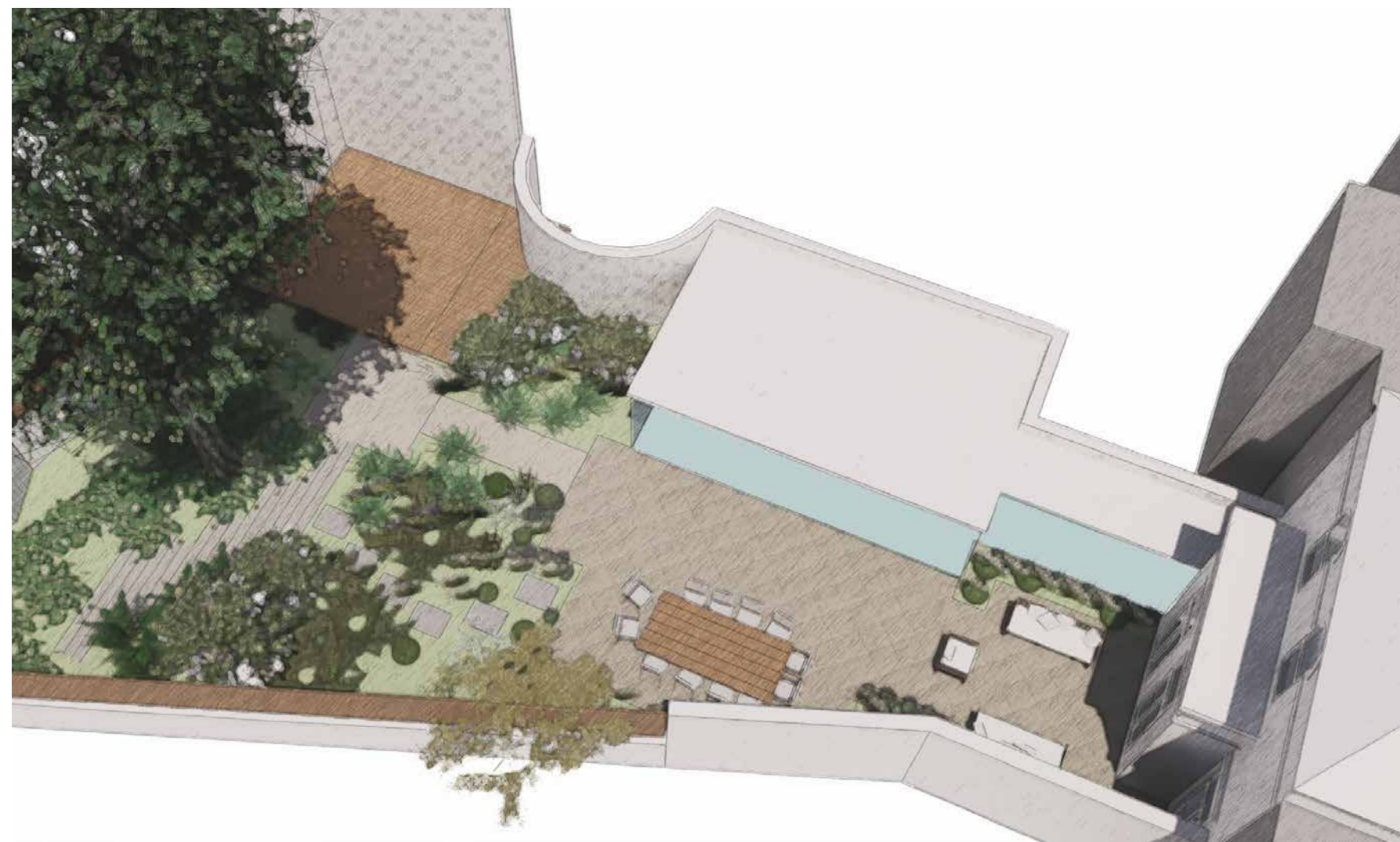
Rear garden sketch