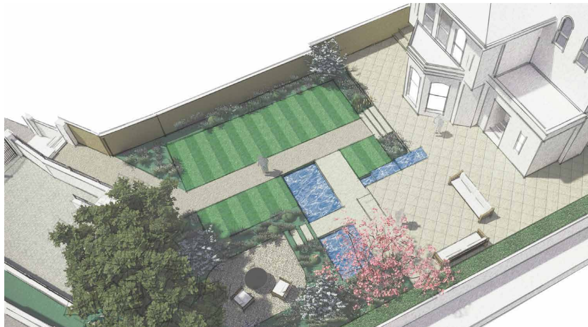
Front garden sketch