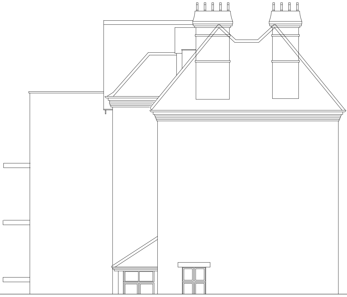
64 Fitzjohns Avenue side Elevation