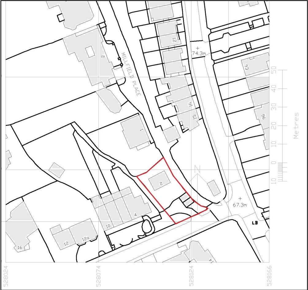
SITE LOCATION PLAN SCALE - 1:1250