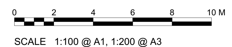
1 GROUND FLOOR PLAN SCALE 1:200 @ A3

RETAIL ENTRANCES TBC ONCE TENANT OCCUPATION IS CONFIRMED