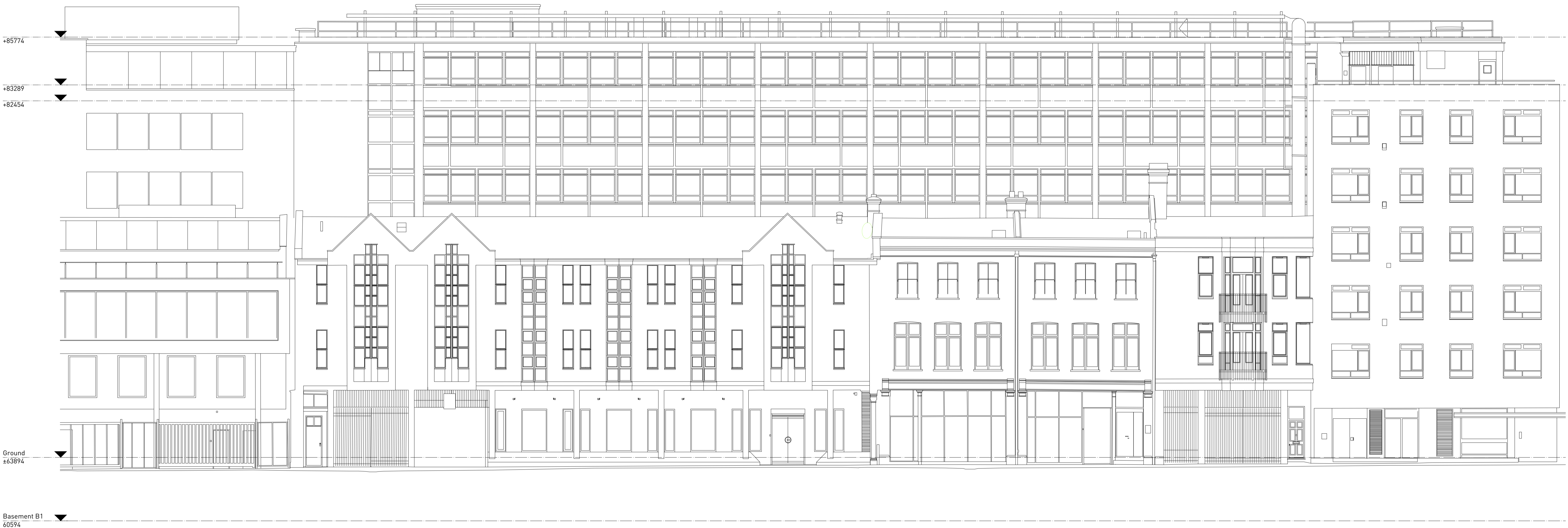
1 EXISTING MORWELL STREET ELEVATION Scale: 1:100