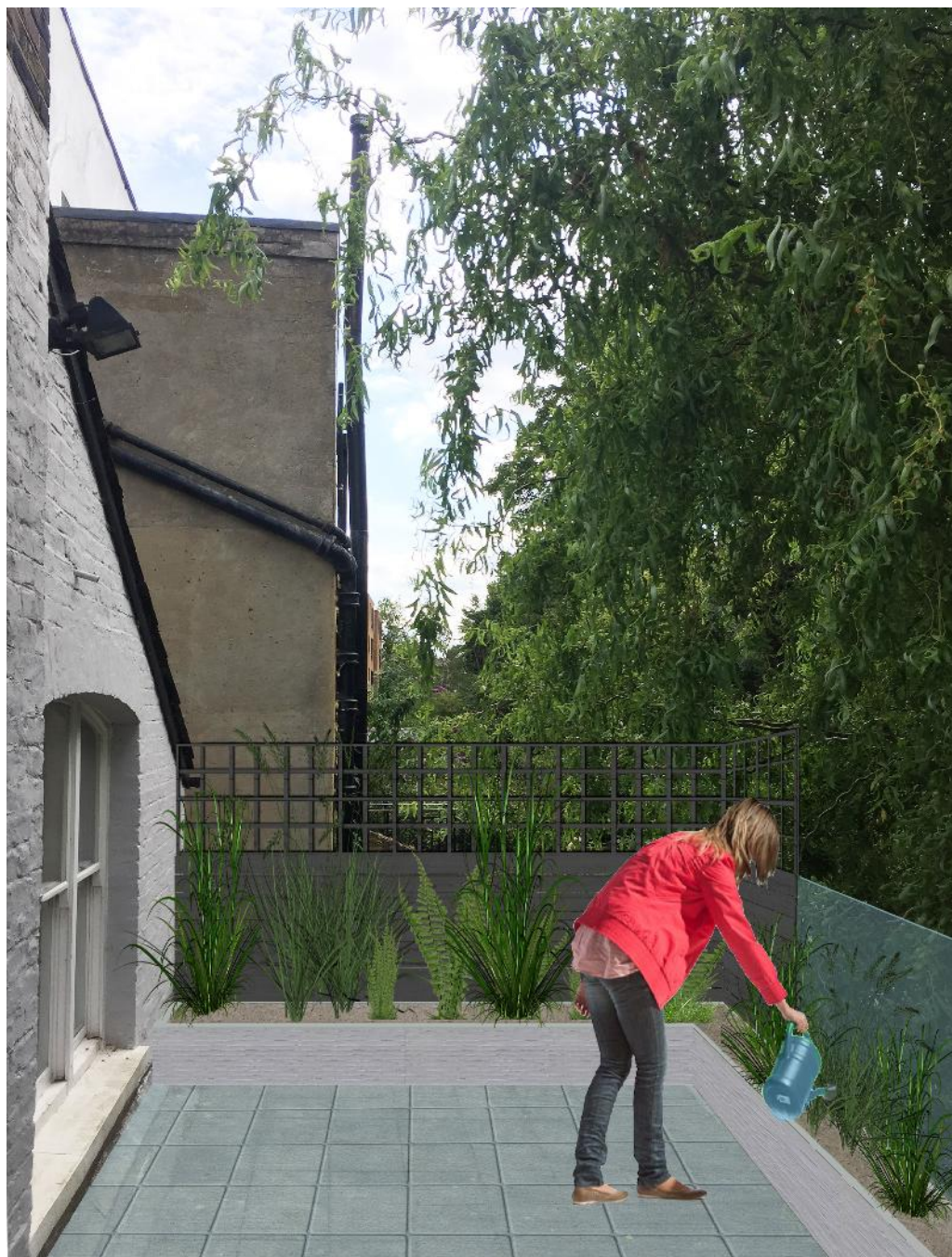
PROPOSED VIEW FROM FIRST FLOOR REAR FLAT ROOF OF 51 UPPER PARK RD