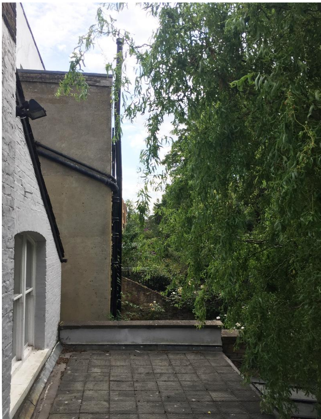
EXISTING VIEW FROM FIRST FLOOR REAR FLAT ROOF OF 51 UPPER PARK RD