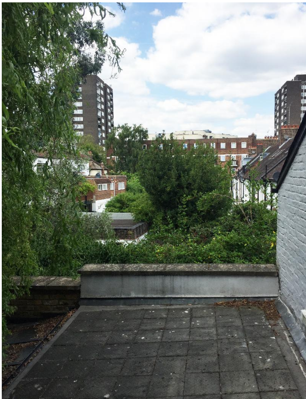
EXISTING VIEW FROM FIRST FLOOR REAR FLAT ROOF OF 51 UPPER PARK RD