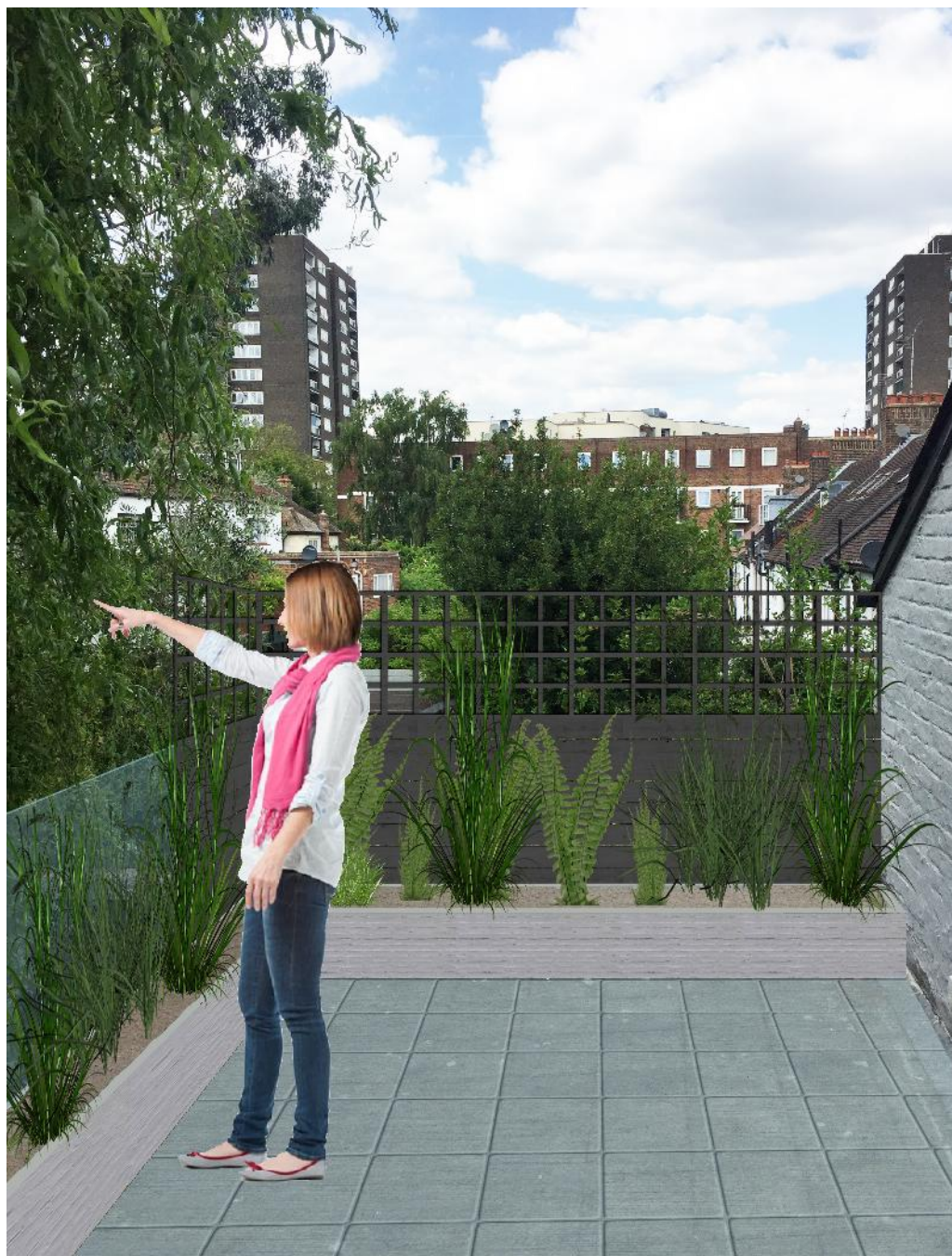
PROPOSED VIEW FROM FIRST FLOOR REAR FLAT ROOF OF 51 UPPER PARK RD