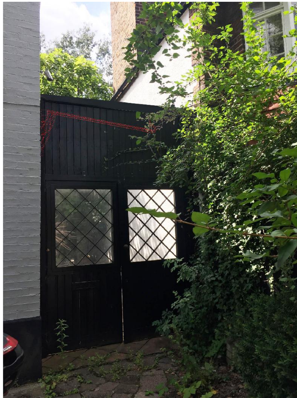
PROPOSED FRONT VIEW OF 51 UPPER PARK RD