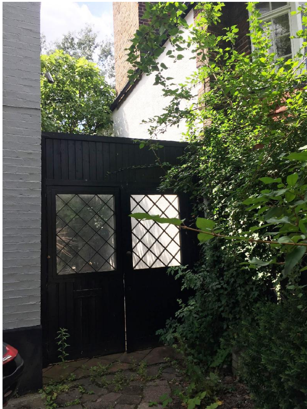
EXISTING FRONT VIEW OF 51 UPPER PARK RD