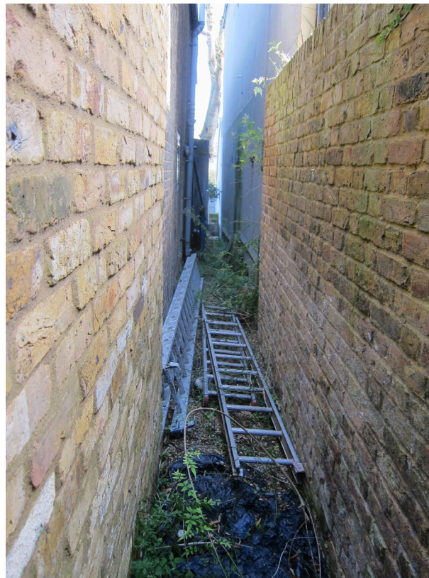
9. SIDE ELEVATION (SOUTH)