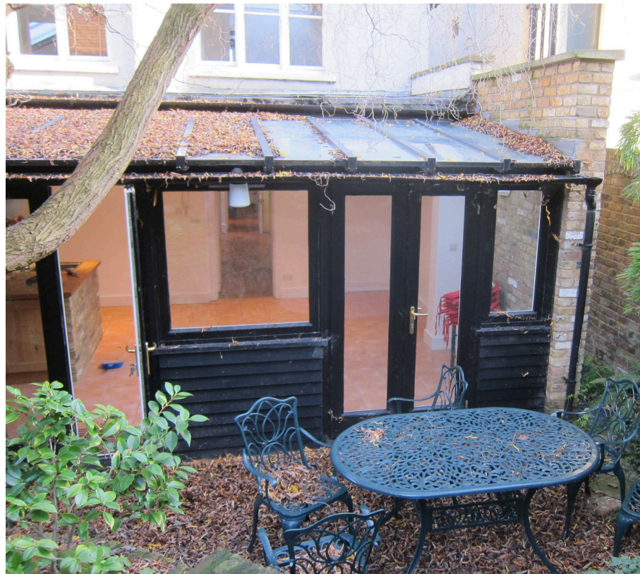
8. REAR ELEVATION