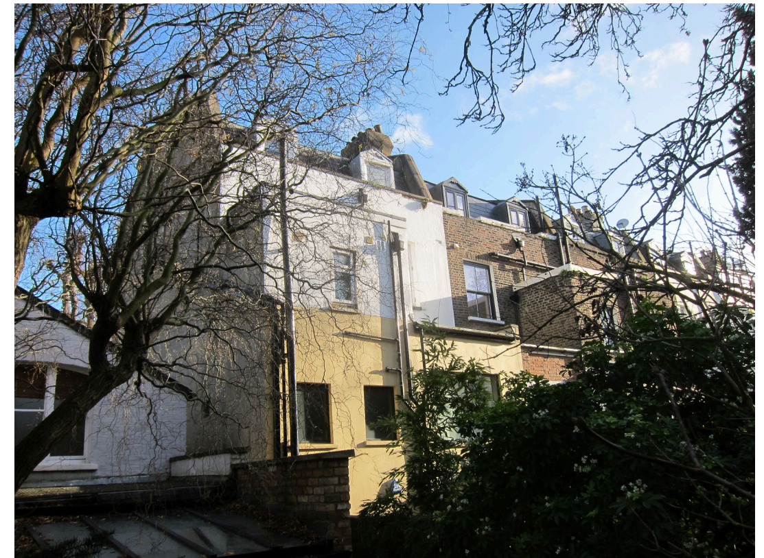
7. REAR ELEVATION (NEIGHBORHOOD)