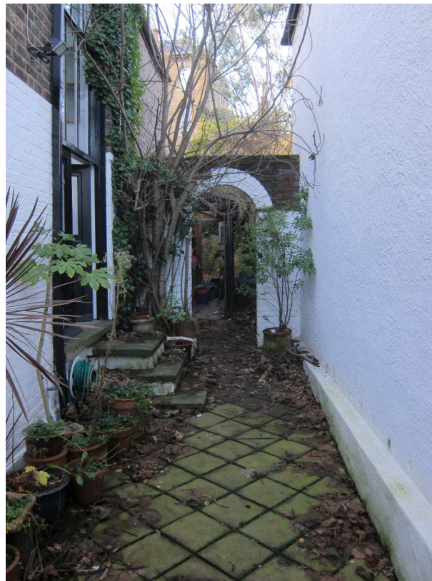
6. SIDE ELEVATION (NORTH)