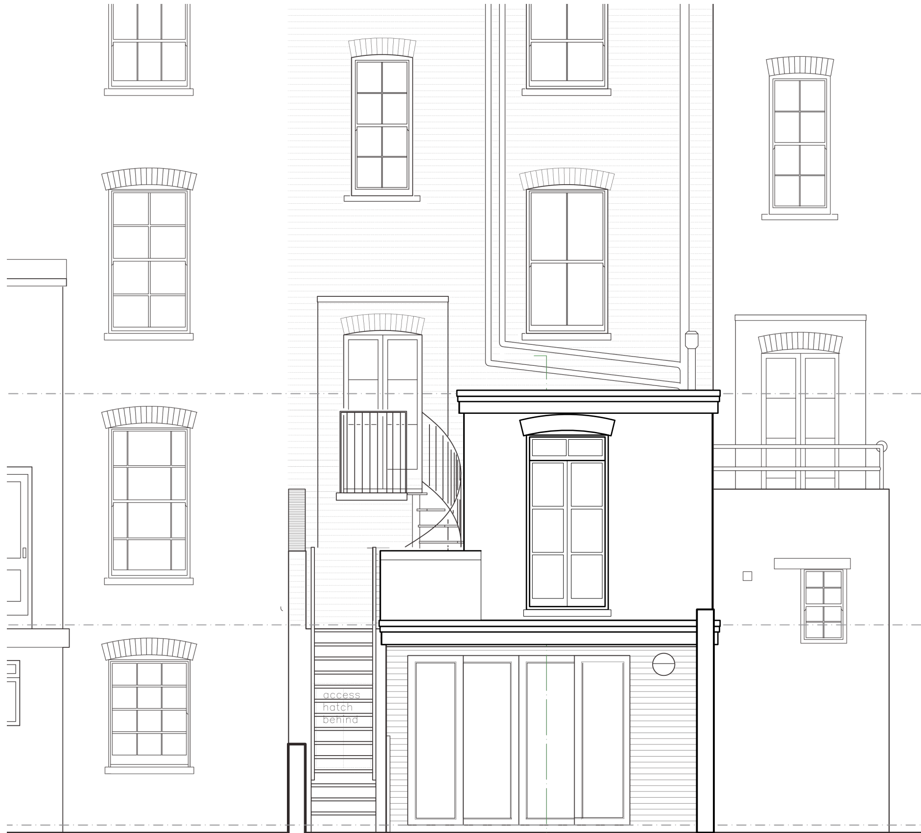
PROPOSED ELEVATION SCALE 1:50 @ A3