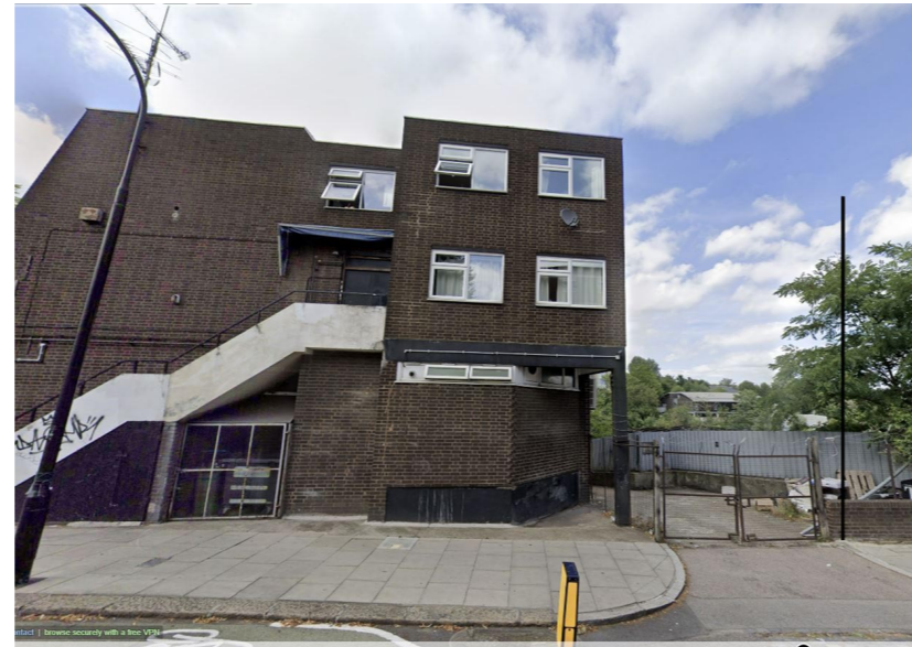
LOCATION A WITH POLE