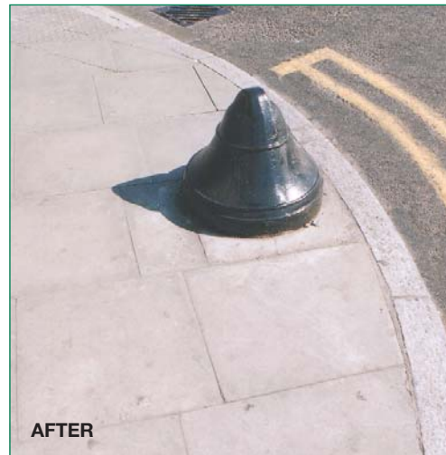
Boulevard improvements in England's Lane