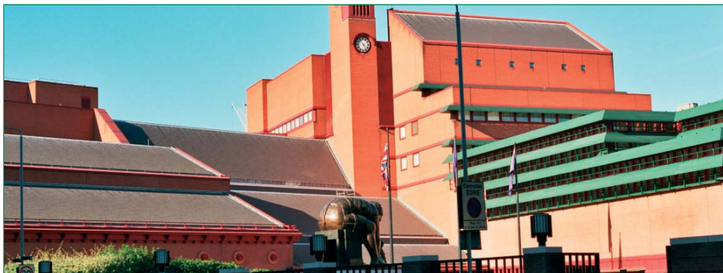
The British Library