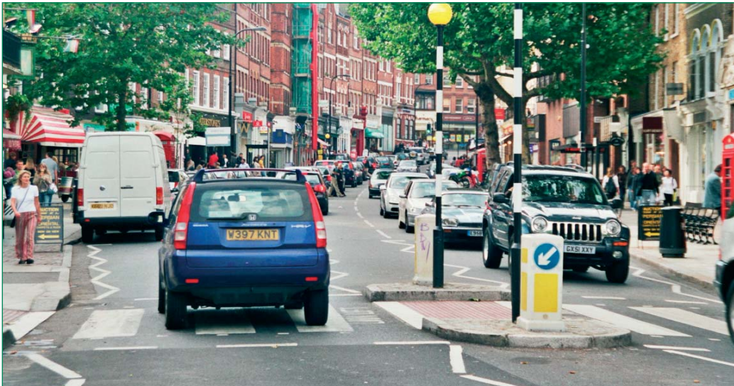
Zebra crossing on Hampstead High Street

This chapter covers design options for the carriageway, including layouts, traffic calming, crossings and carriageway markings. It also contains information on subjects that need more attention paid to them, such as drainage and materials. This section is intended to complement the Highway Works Contract and TSR&GD 2002, by providing clarity on preferred designs where variation is allowed.