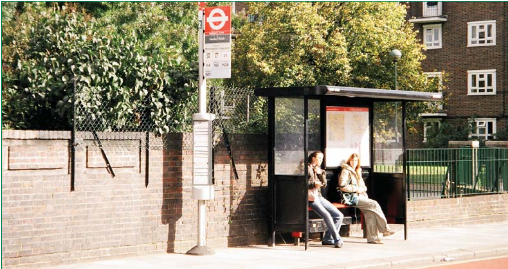
Bus shelter neatly positioned at back of footway

This chapter provides information on major items of street furniture and states preferred designs, colours and positions within the footway and carriageway. With the overarching aim of the manual being to reduce 'visual' street clutter, careful amalgamation, coordination and positioning of street furniture plays a major role in achieving this objective as well as reducing the 'palette' of materials in the street.