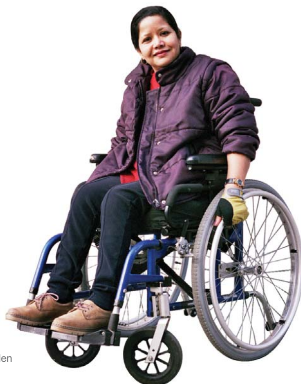
A wheelchair user in Camden