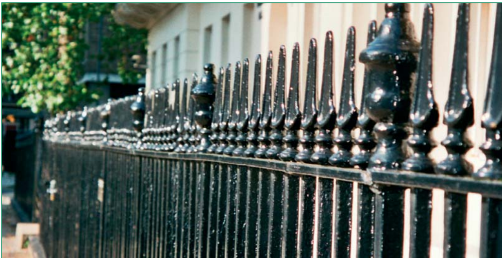
Tavistock Square railings