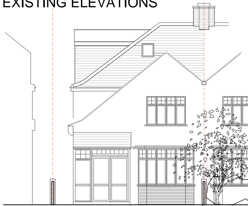
A. Existing From Garden