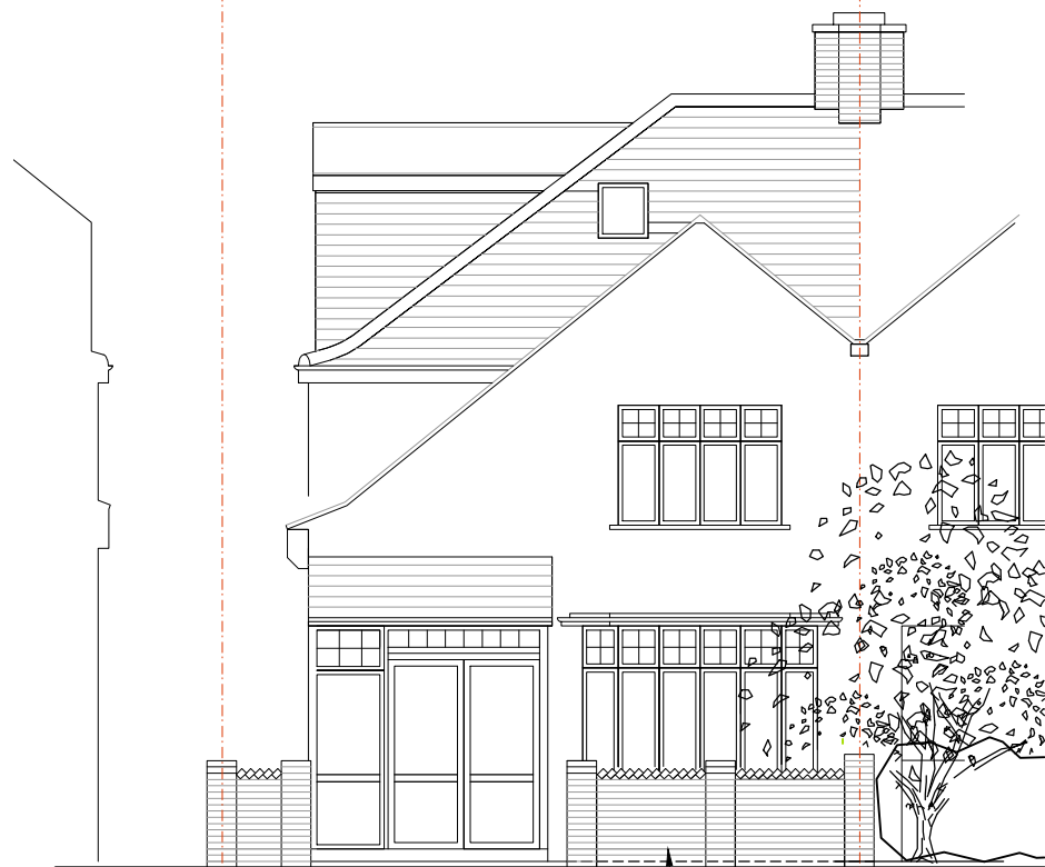
B. From Street

Timber clad bike shed with sedum green roof