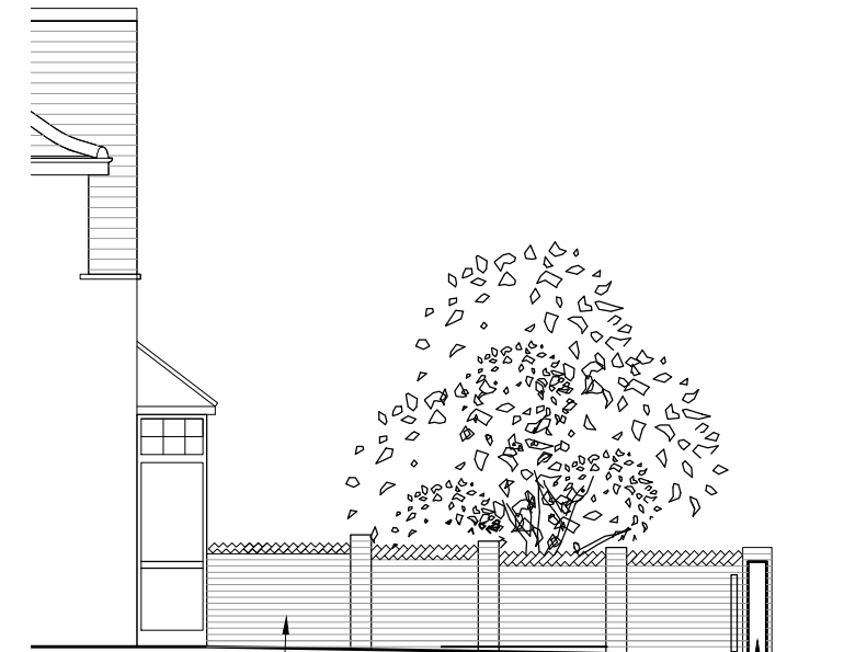
E. Existing Side Elevation