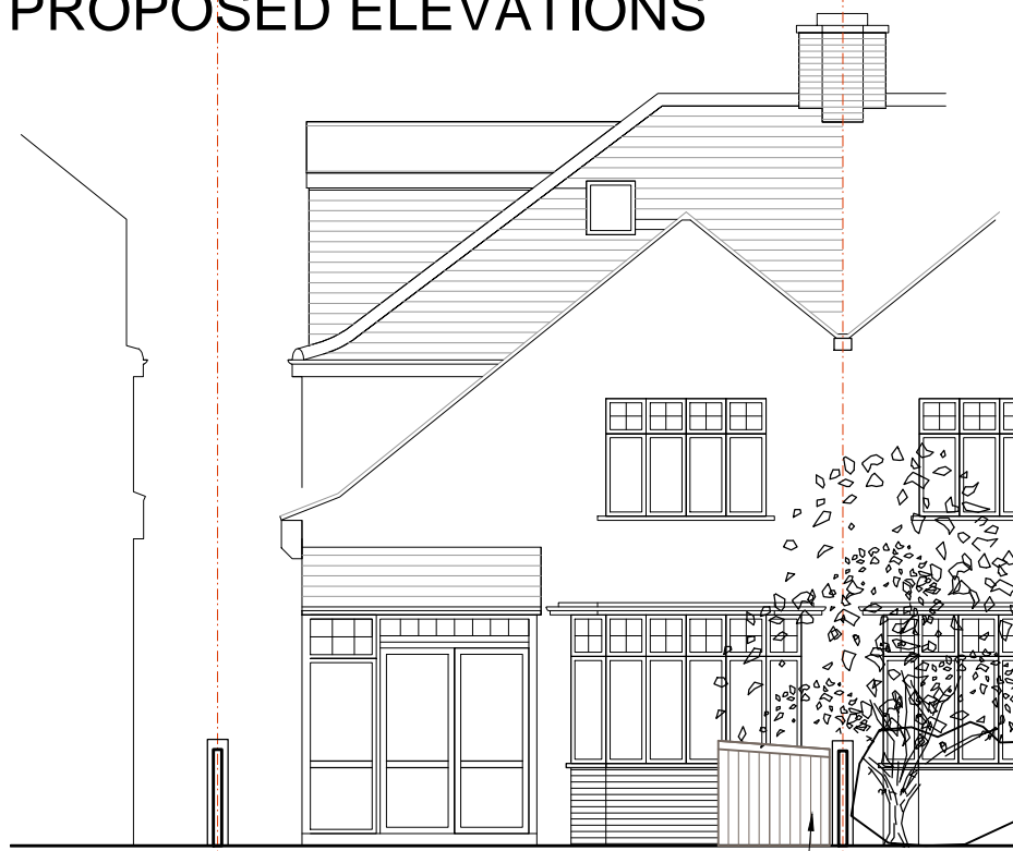
C. From Garden