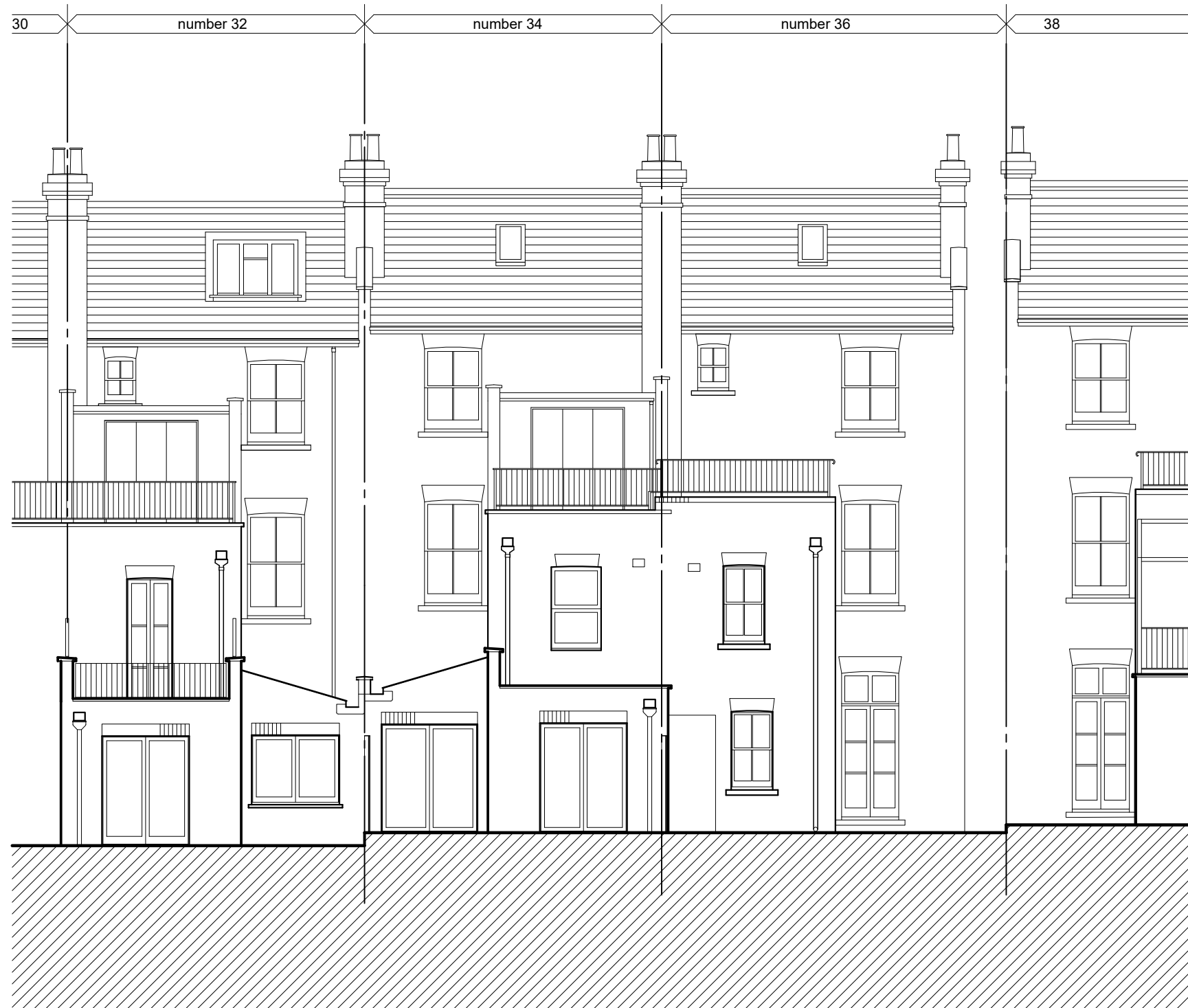
EXISTING REAR ELEVATION OF NUMBER 34 SHIRLOCK ROAD INCLUDING NUMBERS 30,32,36 AND 38 SHIRLOCK ROAD