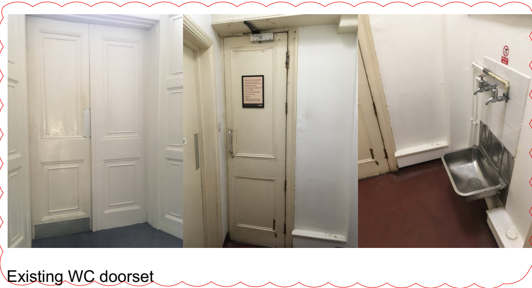
Existing WC doorset