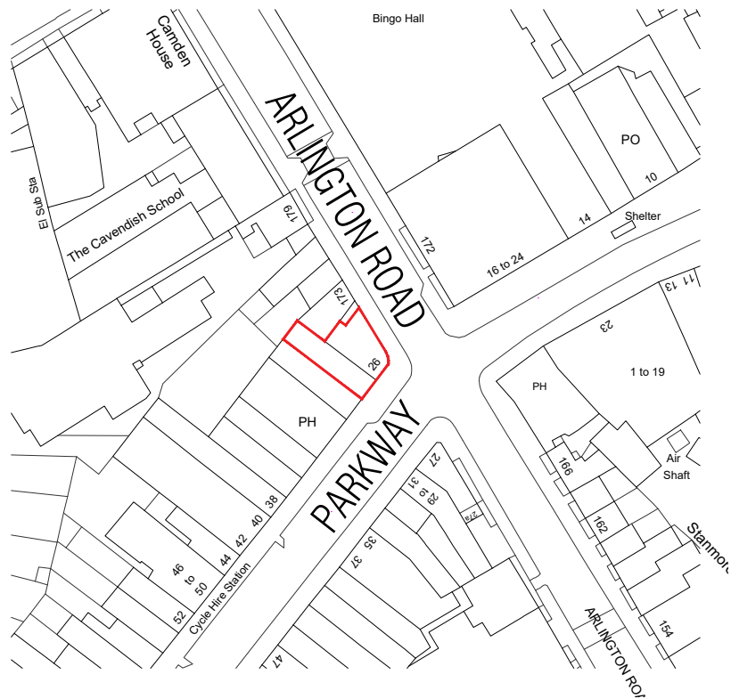
01 LOCATION PLAN SCALE 1:1250 @ A4