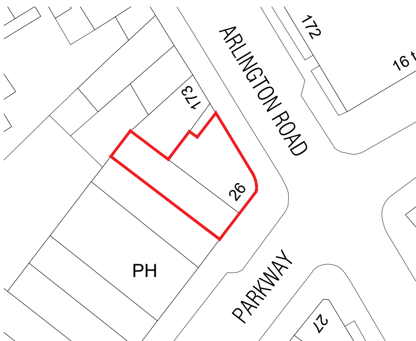
02 SITE PLAN SCALE 1:500 @ A4