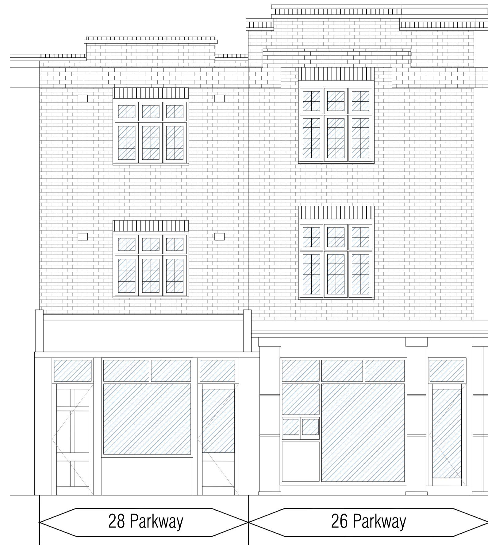
01 EXISTING PARKWAY ROAD ELEVATION SCALE 1:50 @ A1