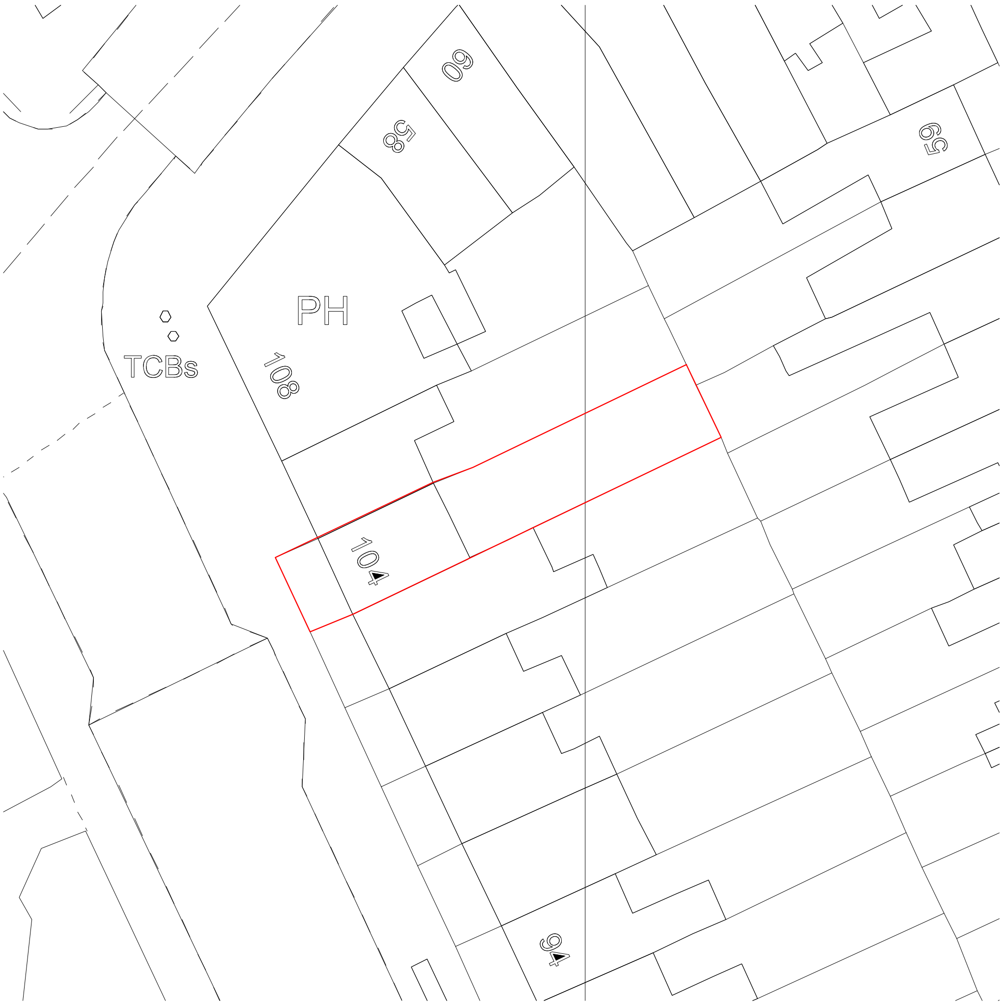
02 SITE PLAN 1:500 @ A3