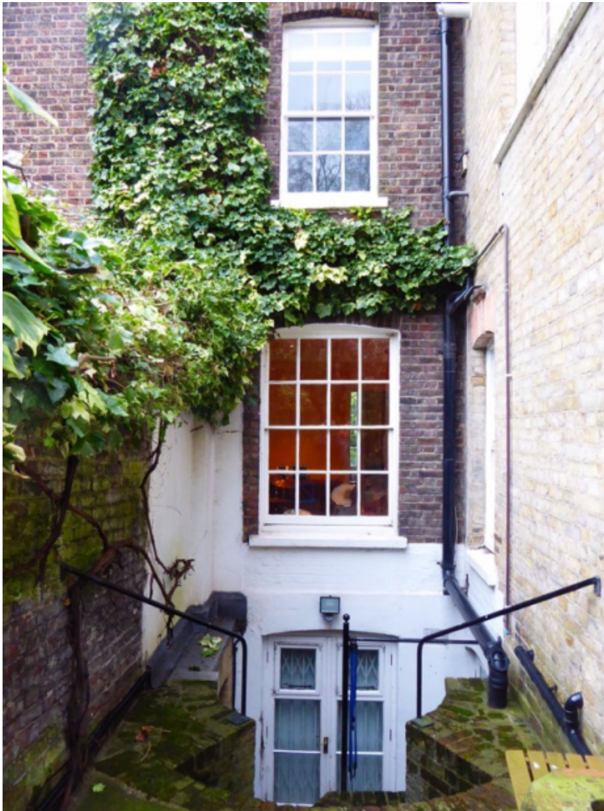
5) Rear elevation of adjoining no.7 (boundary wall to the left)