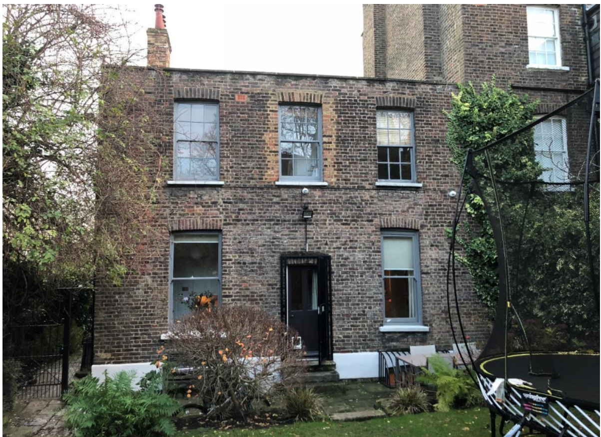
2) Rear elevation of site (no.9) with rear of adjoining no.7 to the right of the image