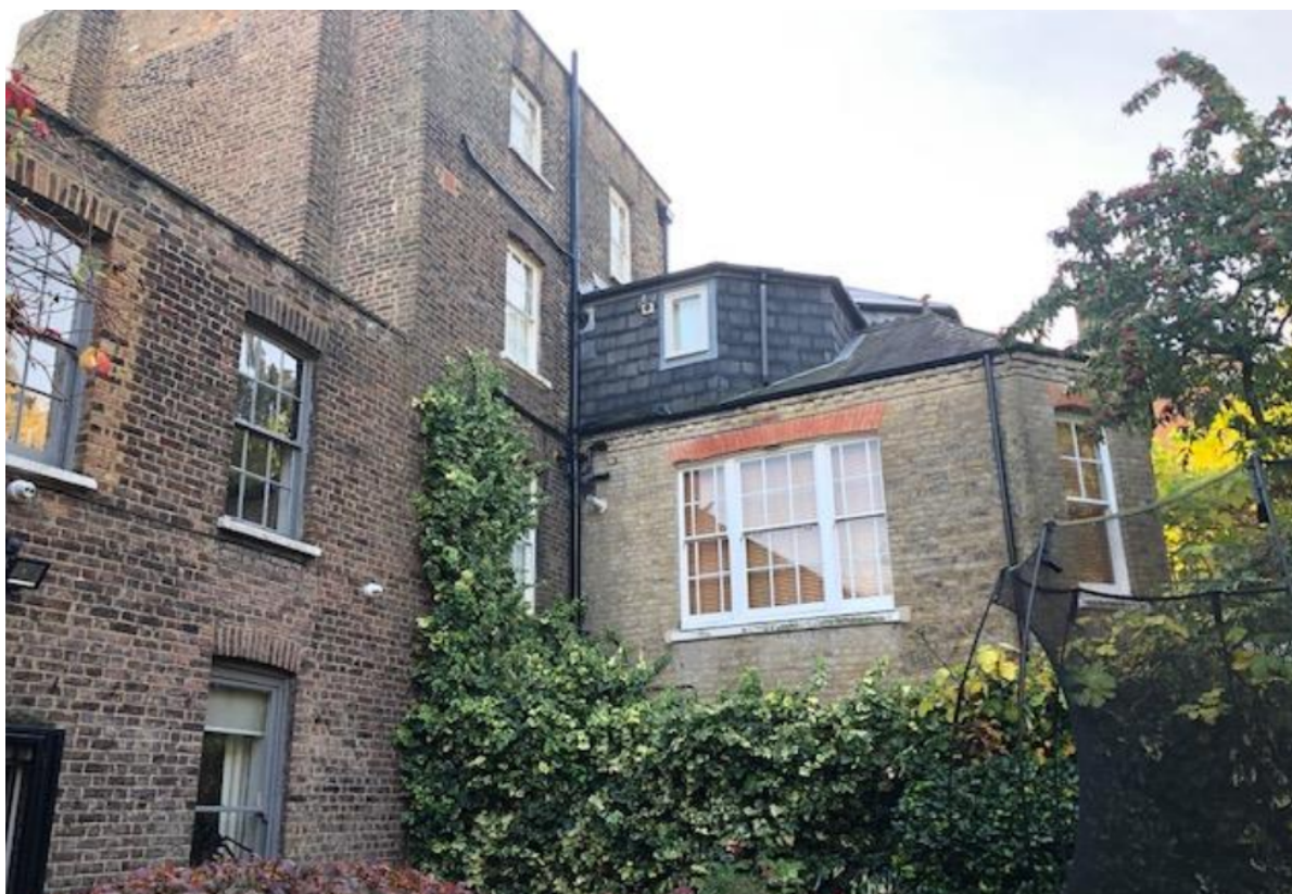
3) Rear extension of adjoining no.7 (taken from the rear garden of the application site)