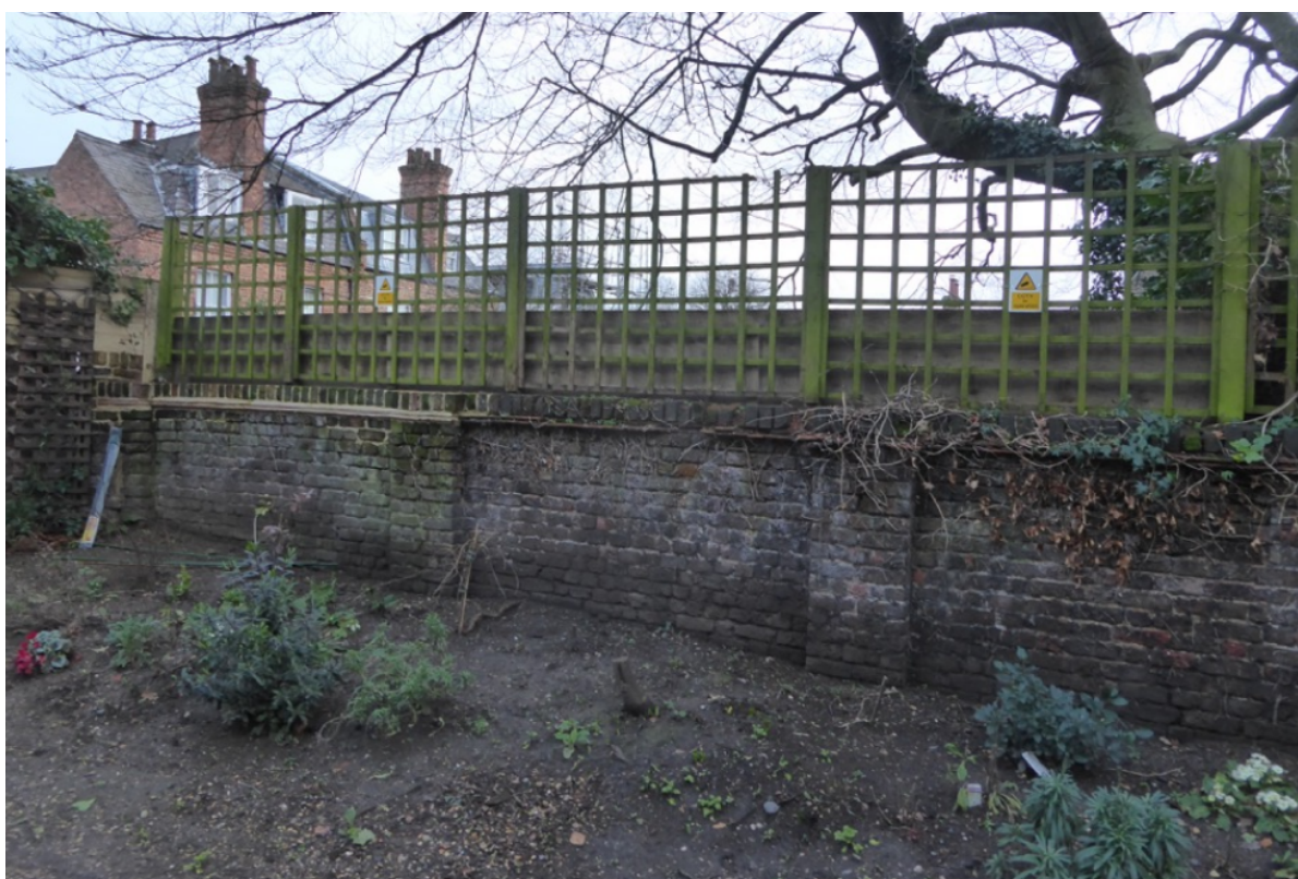
4) Photo from Rosslyn Hill Chapel Grounds (to the rear of the site looking towards the rear garden boundary)