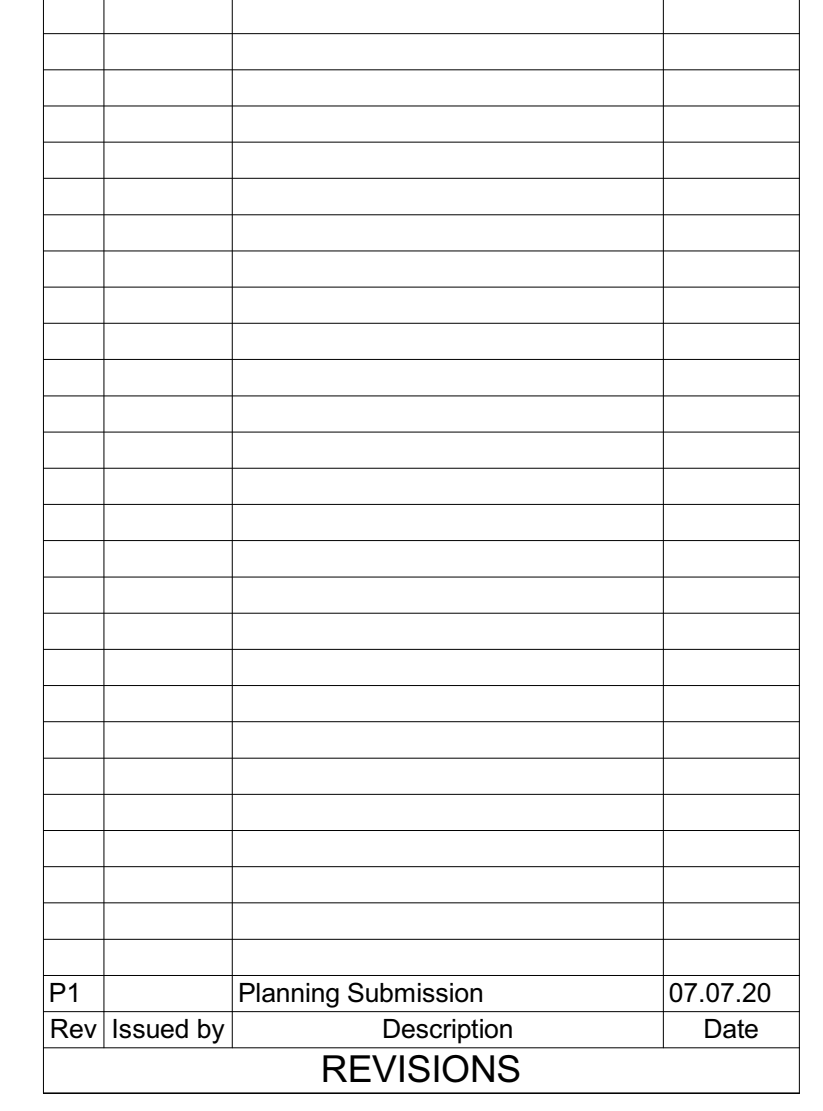
0614 CHESTER ROAD