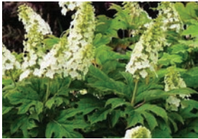
Hydrangea quercifolia 'Snow Queen'