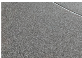
Resin Bound Gravel - Blue Granite