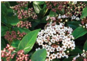
Viburnum tinus 'Eve Price'