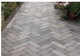
Marshalls Alvanley Pavers - Silver Blend