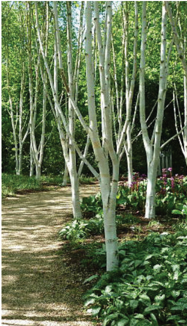
Betula utilis jacquemontii 'Snow Queen'