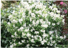
Philadelphus 'Belle Etoile'