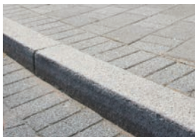
Marshalls Conservation Kerb