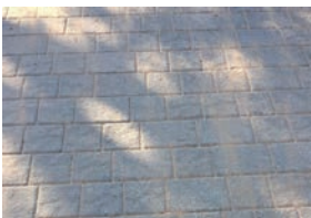
Marshalls Mistral Paving - Charcoal