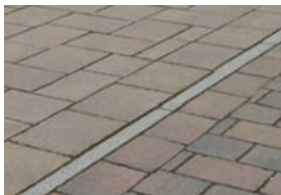
Marshalls Square Channel