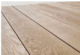
Millboard Decking - Golden Oak