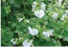
Geranium macrorrhizum 'White-Ness'