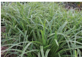
Carex 'Ice Dance'