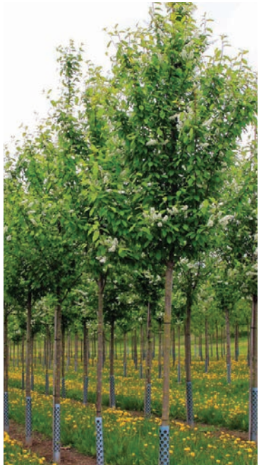
Prunus padus 'Albertii'