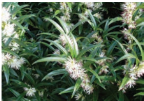
Sarcococca hookeriana var. digyna