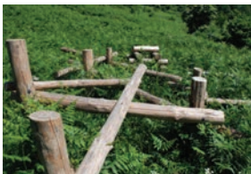
EarthWrights bespoke play equipment