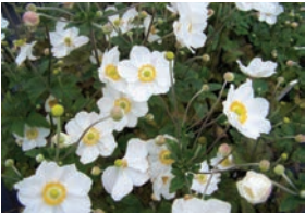
Anemone x hybrida 'Honorine Joubert'