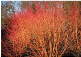
Cornus 'Midwinter Fire'