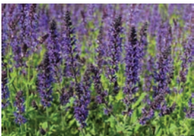
Salvia x sylvestris 'Mainacht'