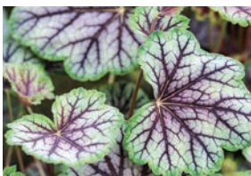
Heuchera 'Green Spice'