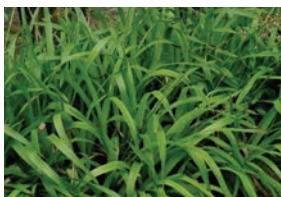
Luzula sylvatica 'Aurea'