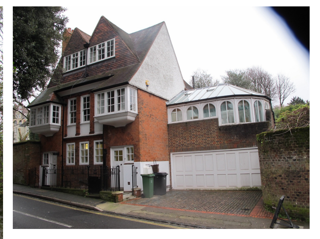
Fig. 3 View from street