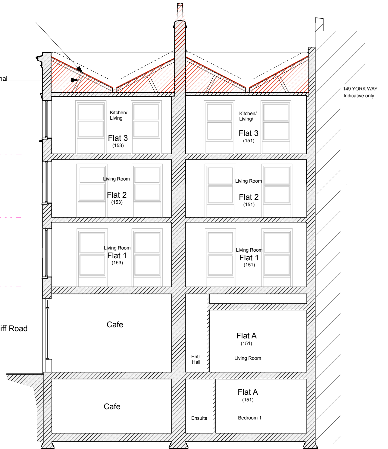
Section B-B - Through 151 & 153 York Way