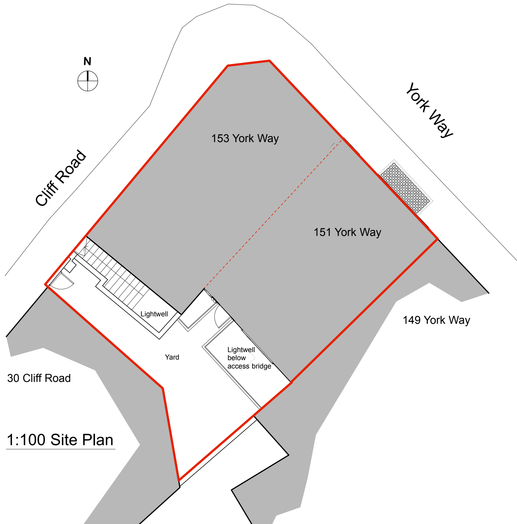
1:100 Site Plan