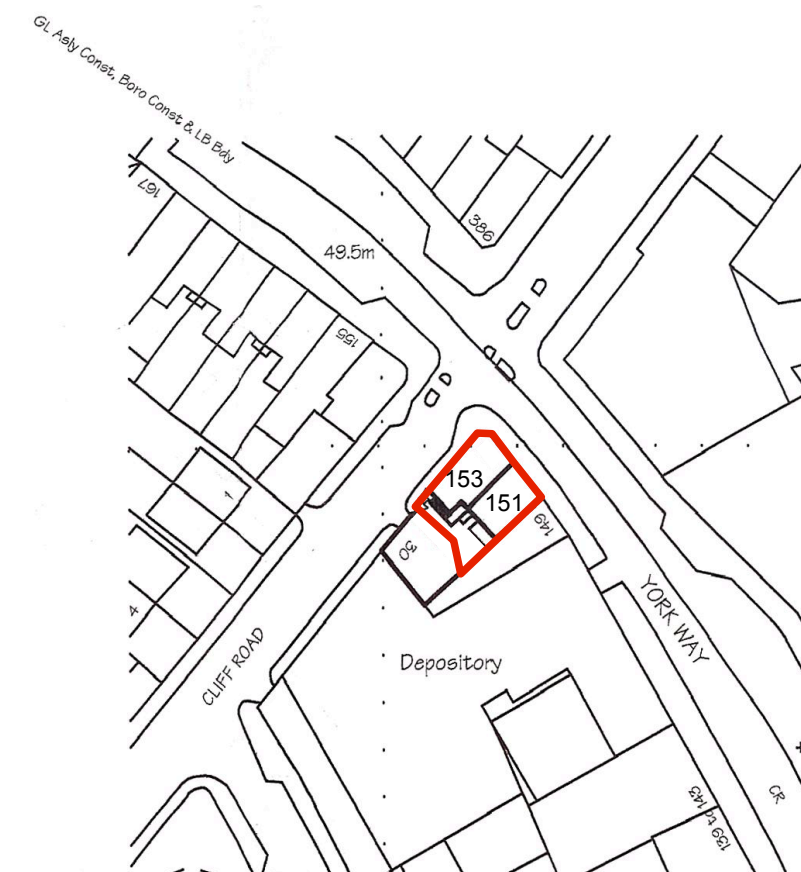
1:1250 Location Plan

These particulars do not constitute, nor constitute any part of, an offer or a contract. All statements contained in these particulars as to this property are made without the responsibility on the part of Norton Ellis Architects Ltd. or the Vendors or Lessors. None of the statements contained in these particulars are to be relied on as statements or representations of fact. All measurements are approximate and no responsibility is taken for any error, omission, or mis-statement and any intending purchaser or tenants must satisfy themselves by inspection or otherwise as to the correctness of each of the statements contained in these particulars/ plans. All dimensions to be checked on site and any discrepancy to be reported to the Architect prior to construction. This drawing to be read in conjunction with all other drawings including those of other consultants. Samples of all materials to be provided for comment/ approval prior to fabrication/construction. © 2020 Norton Ellis Architects Ltd.