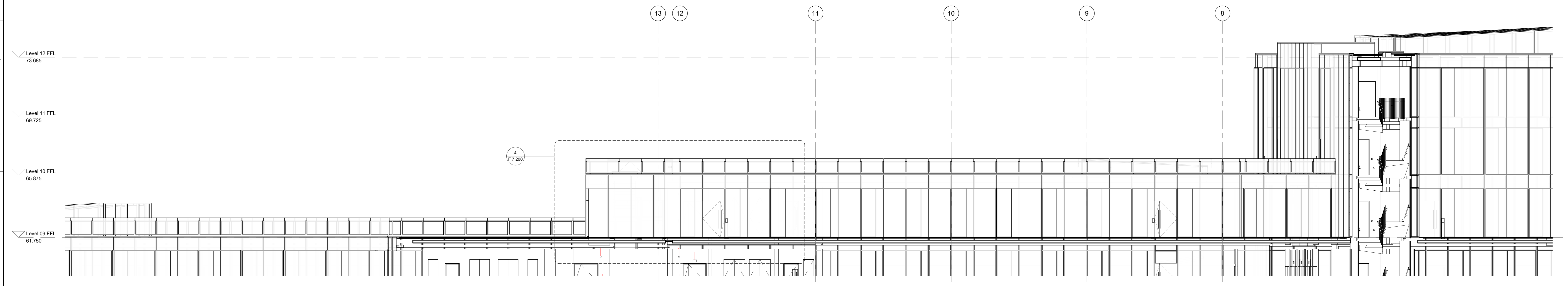
2 Existing Part Section - West 1:50