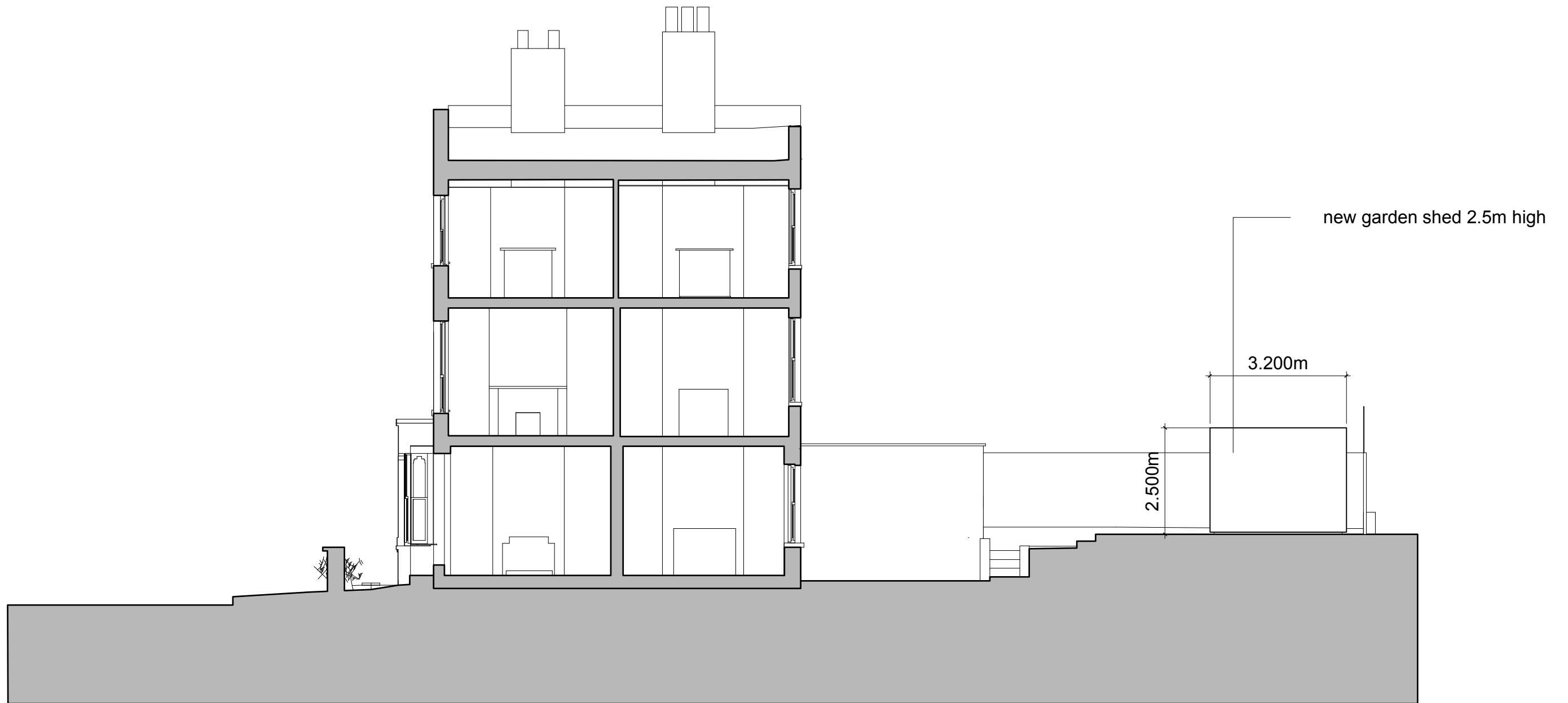
01: Longitudinal Section through Existing House and Rear Garden