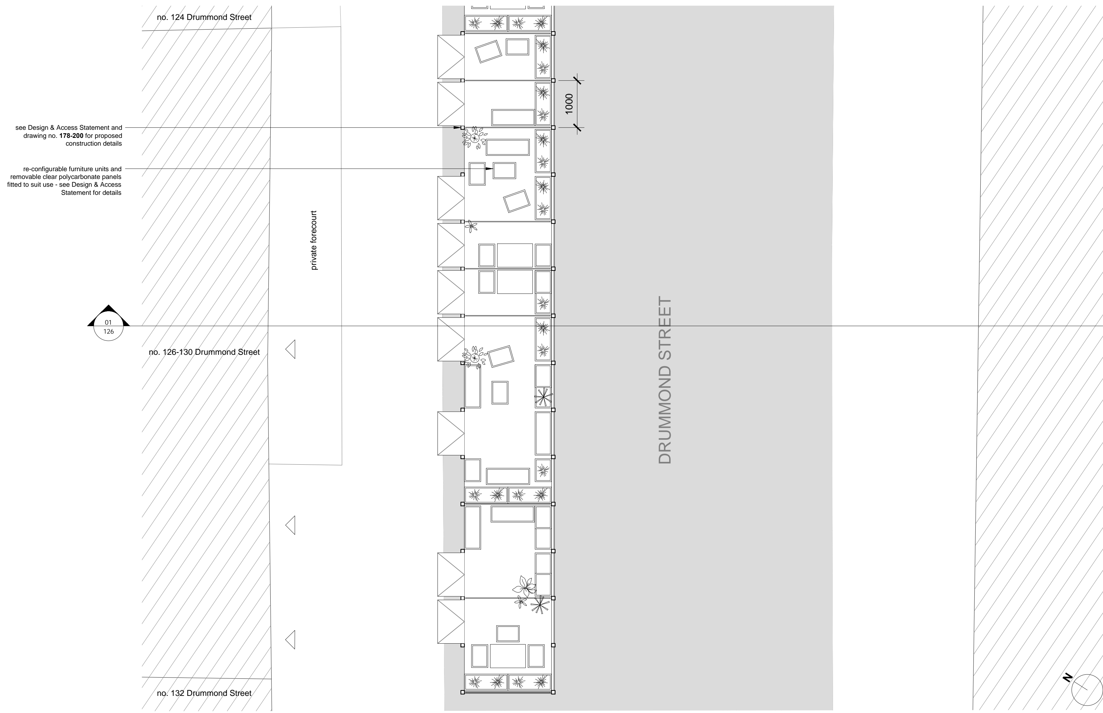
2 Street Plan