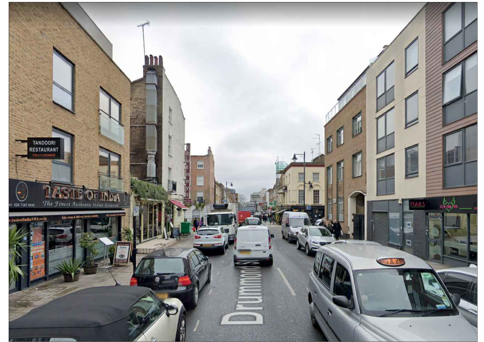
3 Existing Street View