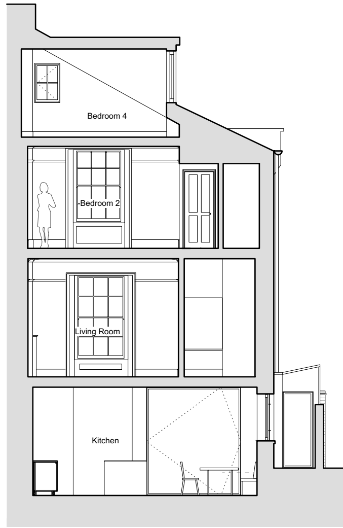
Section A-A Section