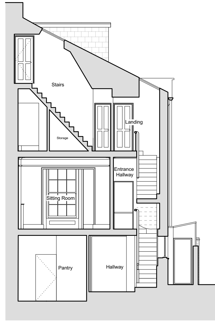
Section B-B Section