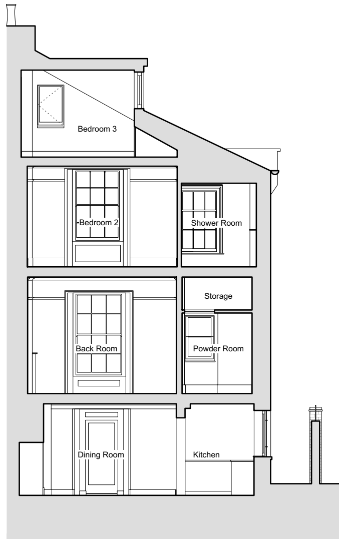
Section A-A Section