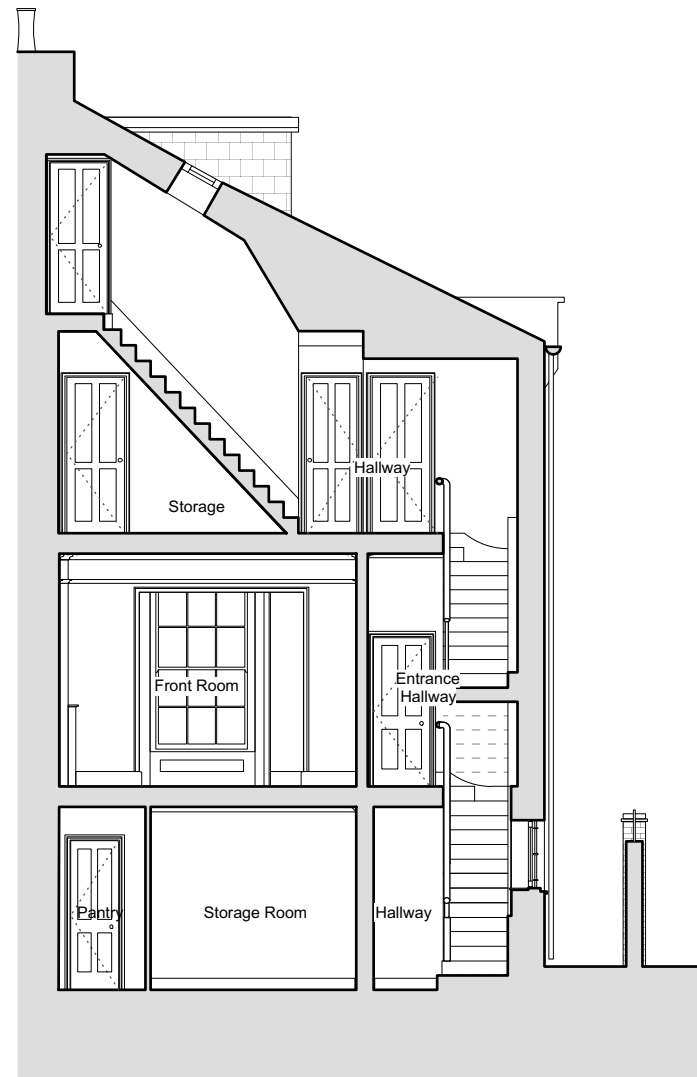
Section B-B Section