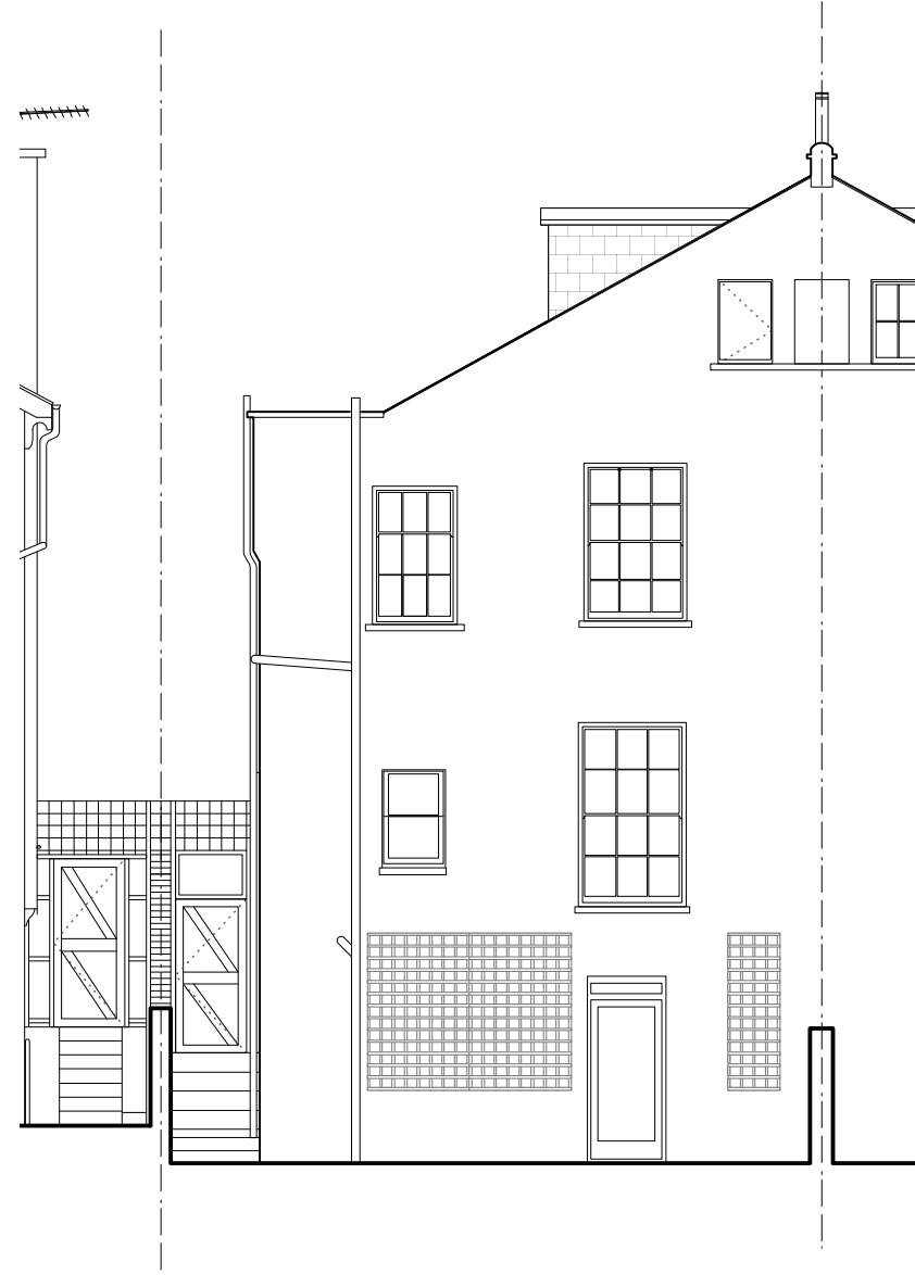
Rear Elevation Elevation

NAGAN JOHNSON ARCHITECTS 2 Pontypool Place London SE1 8QF | studio@naganjohnson.co.uk | 0207 633 0200