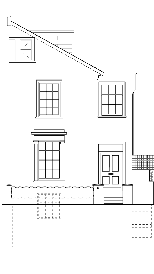
Front / Street Elevation Elevation