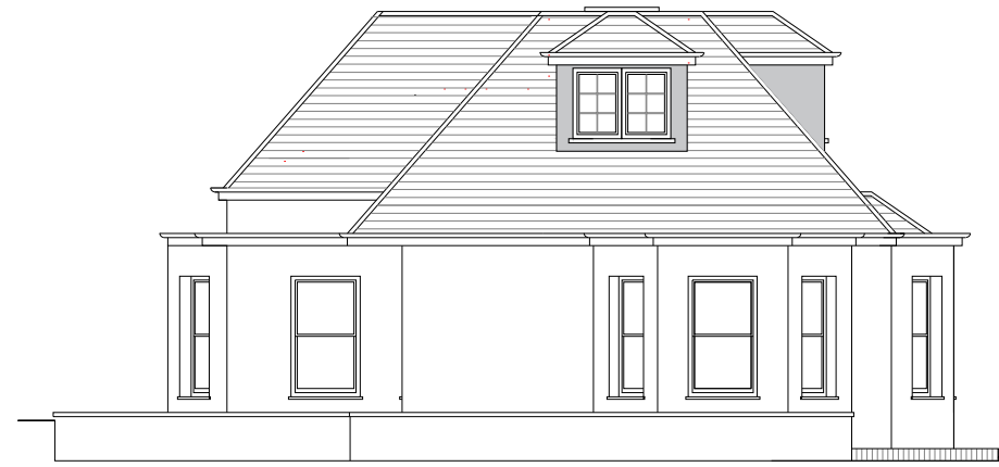
PROPOSED NORTH SIDE ELEVATION