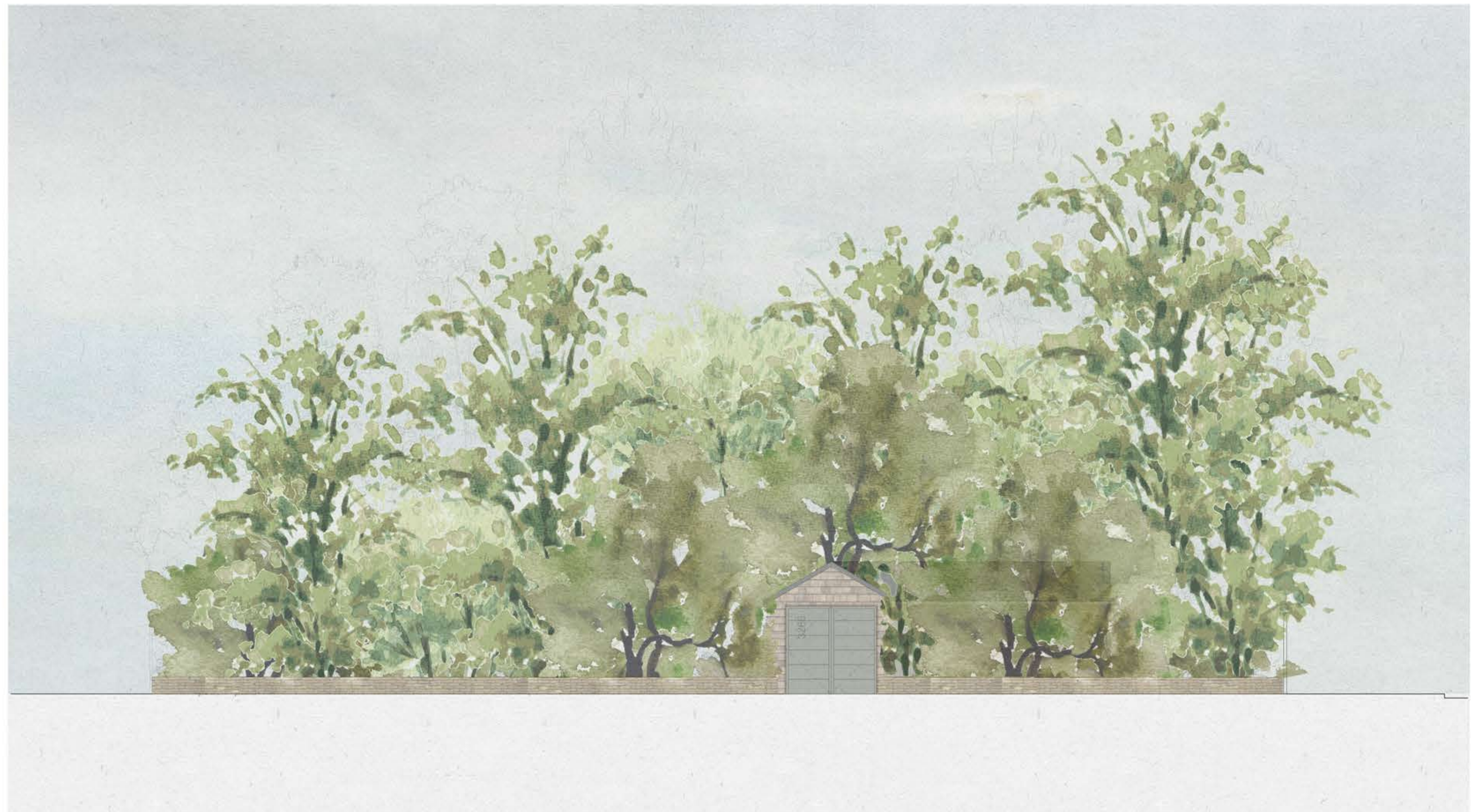
1 1:75@A1 ELEVATION FROM ACCESS ROAD