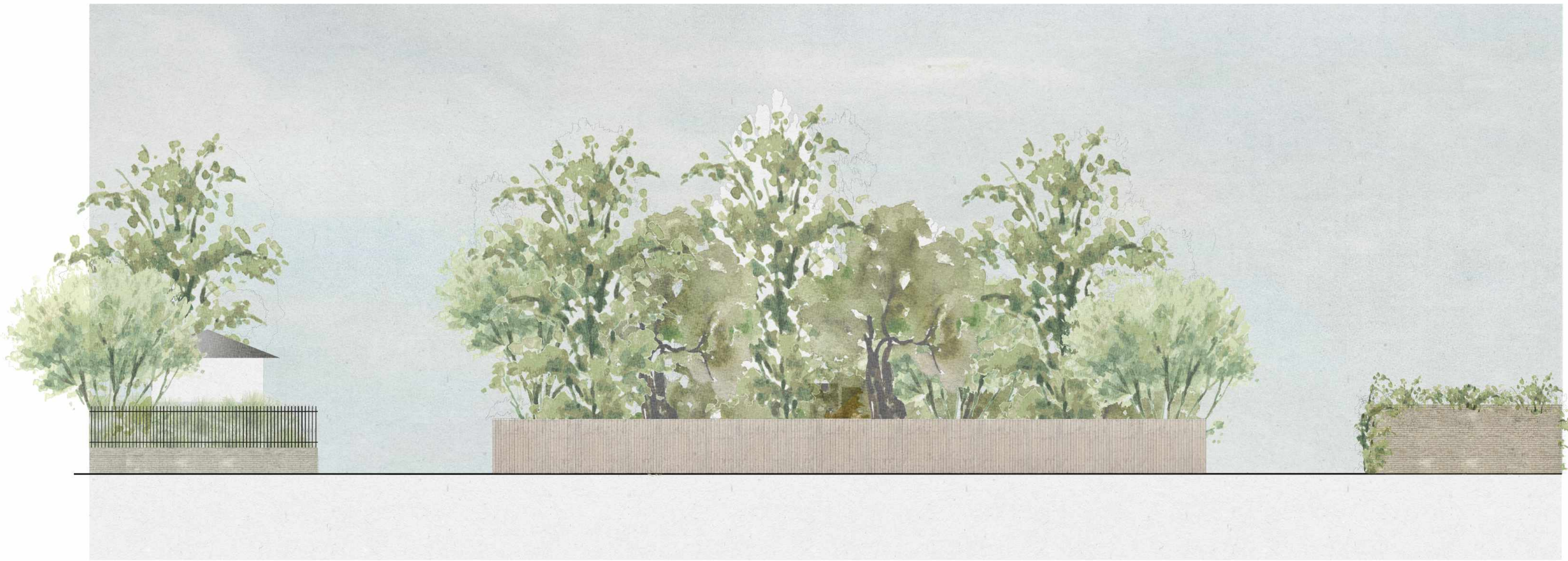
1 1:75@A1 ELEVATION FROM HIGHGATE WEST HILL STREET For illustrative purposes only