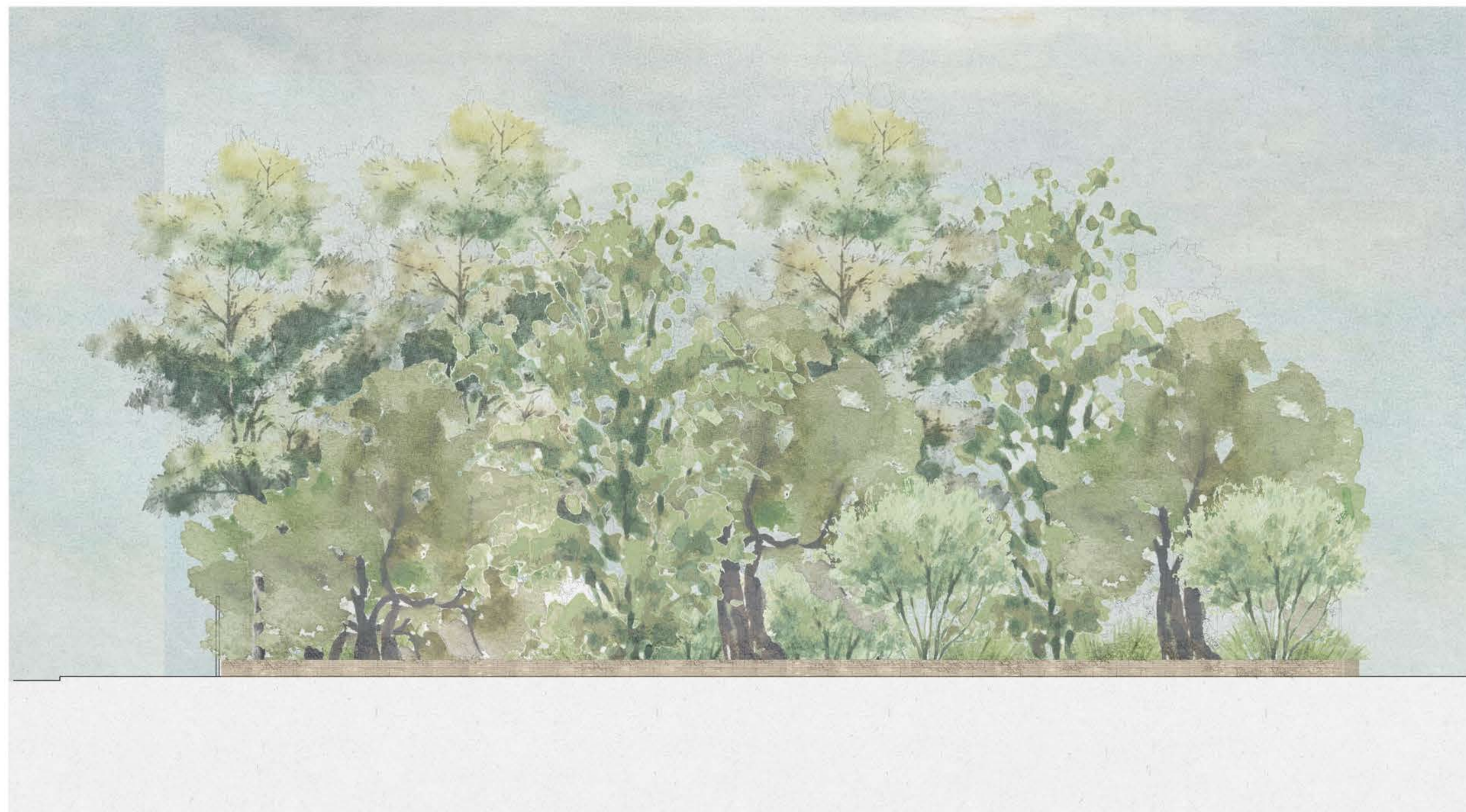
1 1:75@A1 ELEVATION