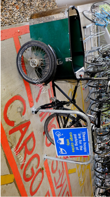
Typical Cargo Bicycle Bay

Capacity: 2 Cycles Standard Single Unit Size: Width: 715mm Height: 800mm Diameter: 48.3mm Spacing between cycle stands:800mm Fixings: Baseplate Fixed support to manufacturer's recommendations Finish: Galvanised to BS EN ISO 1461:2009