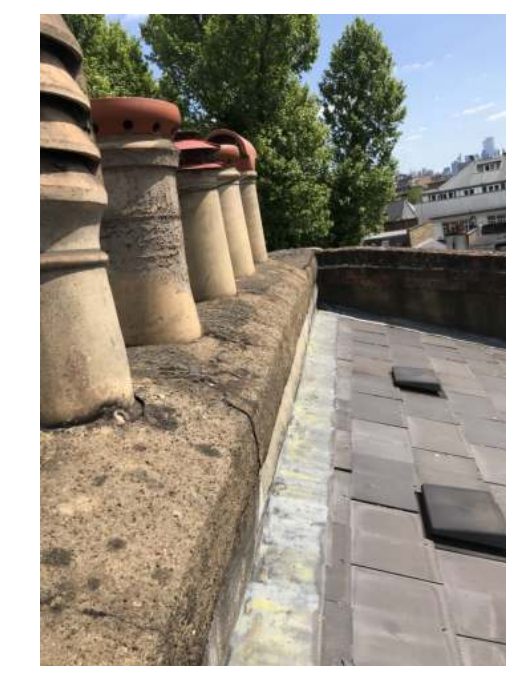
View 9: chimney pots on party wall with No. 15

View 1: View 2: parapet. View 3: View 4: View 5: View 6: felt. A TV aerial is fixed View 7: View 8: View 9: