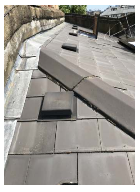
View 4: hip & party wall with No. 15