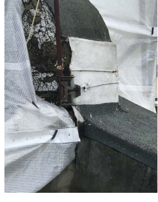
View 6: front parapet pediment crown showing aerial fixing