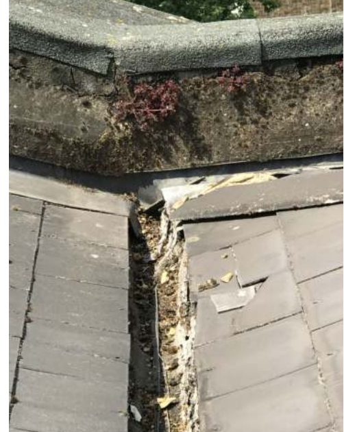
View 8: central valley gutter junction with front parapet