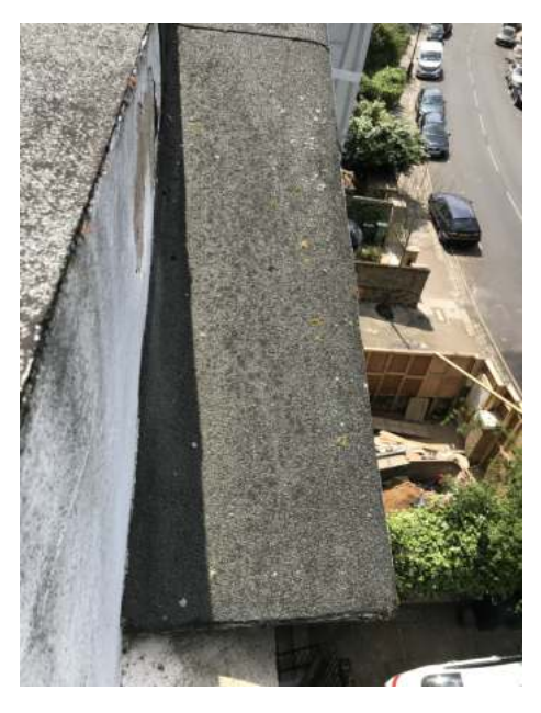
View 5: front parapet and pediment lower section