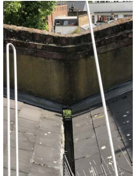
View 2: view 1 gutter outlet