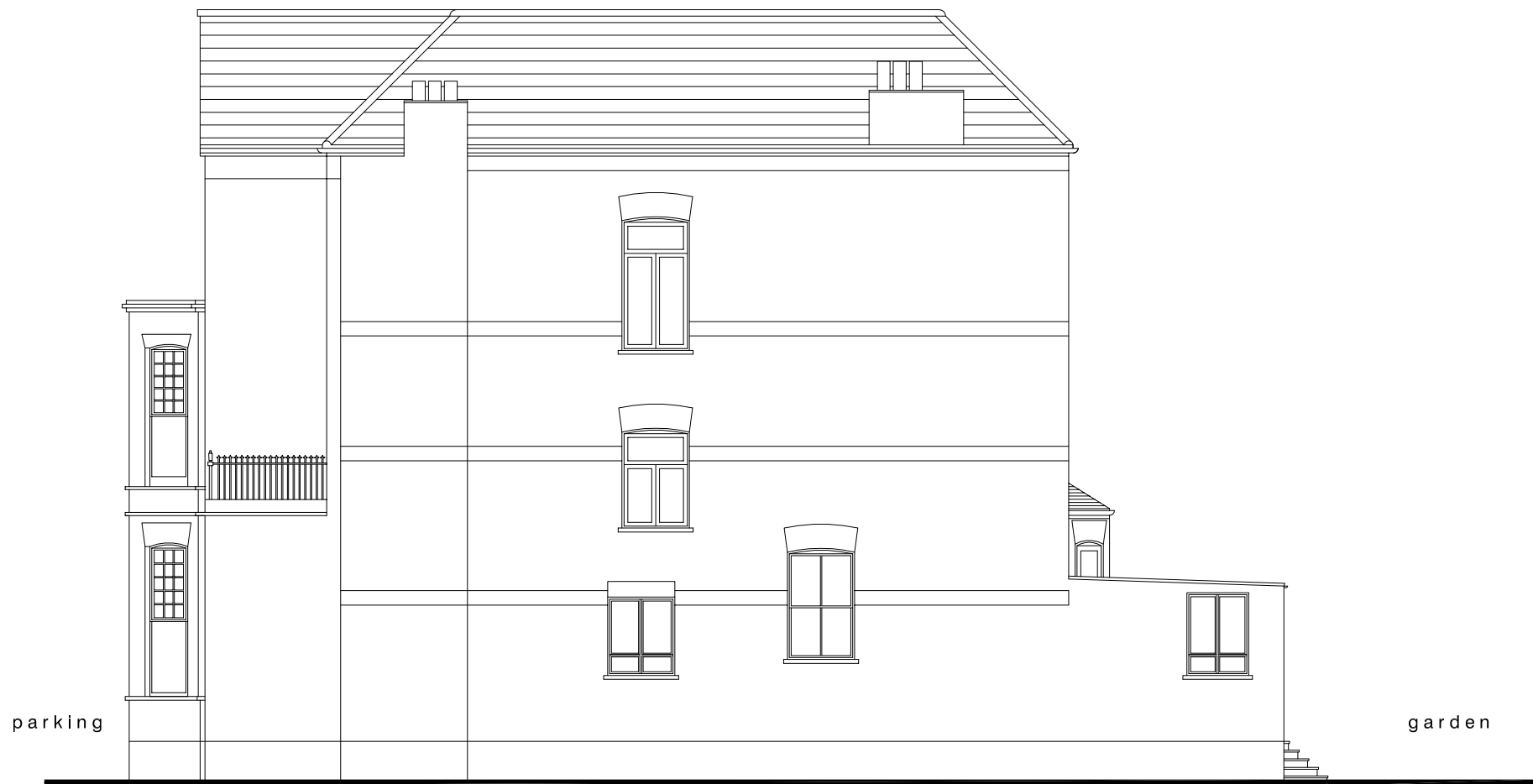
east (flank) elevation as existing