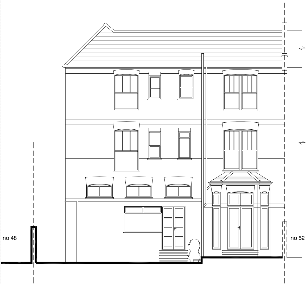
rear elevation as existing