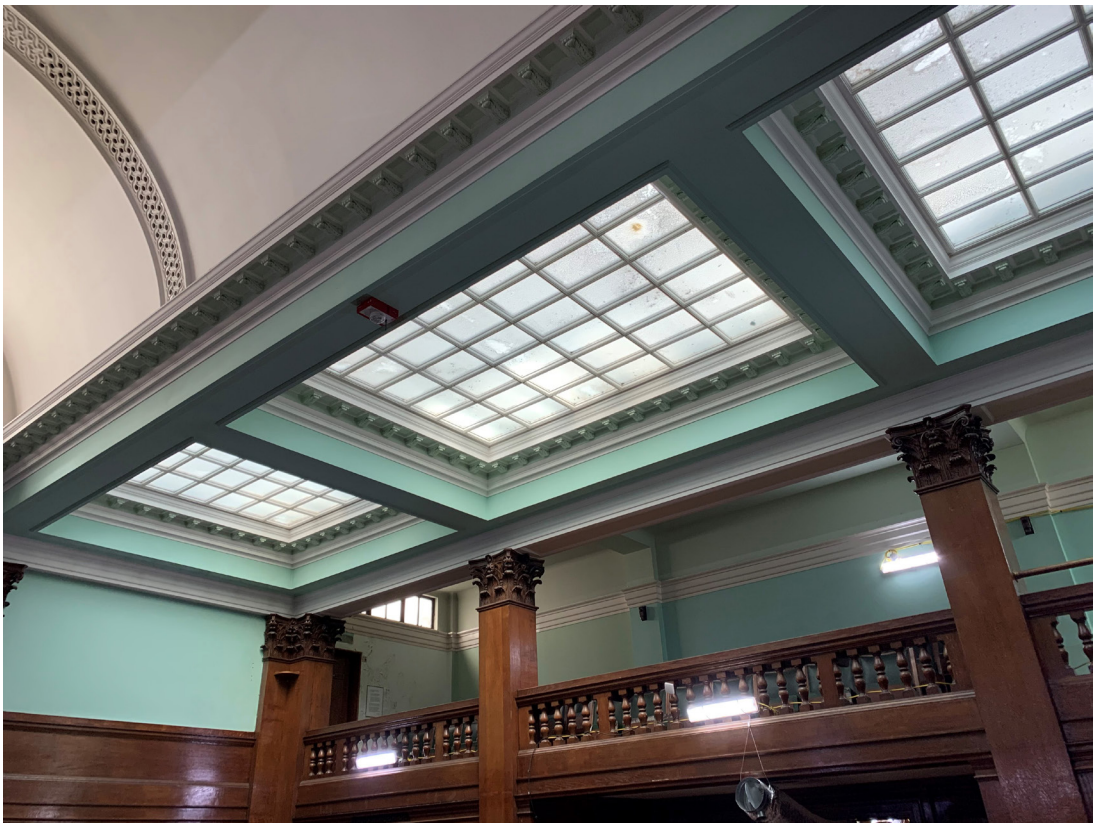
Existing glass diffuser. Larger central section and two smaller sections

Upon inspection it is believed that the glass currently installed is likely a 6mm thick, monolithic Pilkington Arctic patterned glass. This was one of the standard patterned glasses used widely throughout the 1980's.If broken it will fall in dangerous shards and would not therefore would not be used these days for overhead glazing.