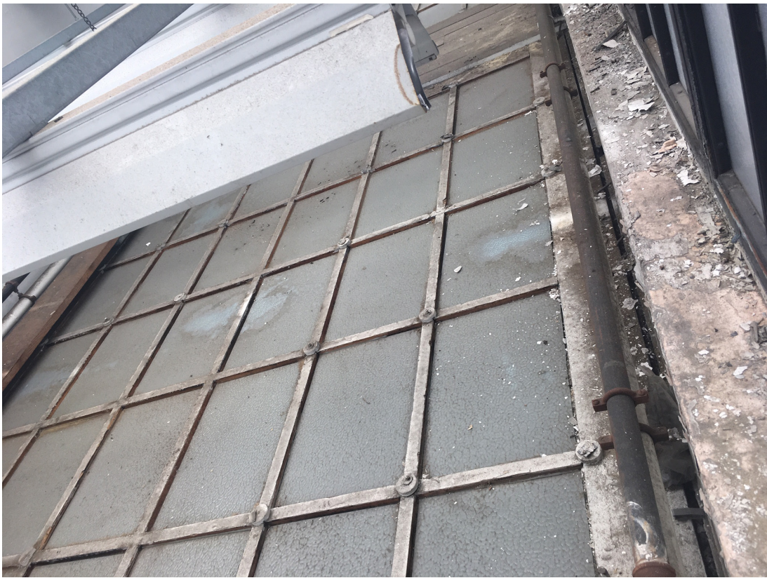
View from inside the ceiling void looking down at the top of the diffuser