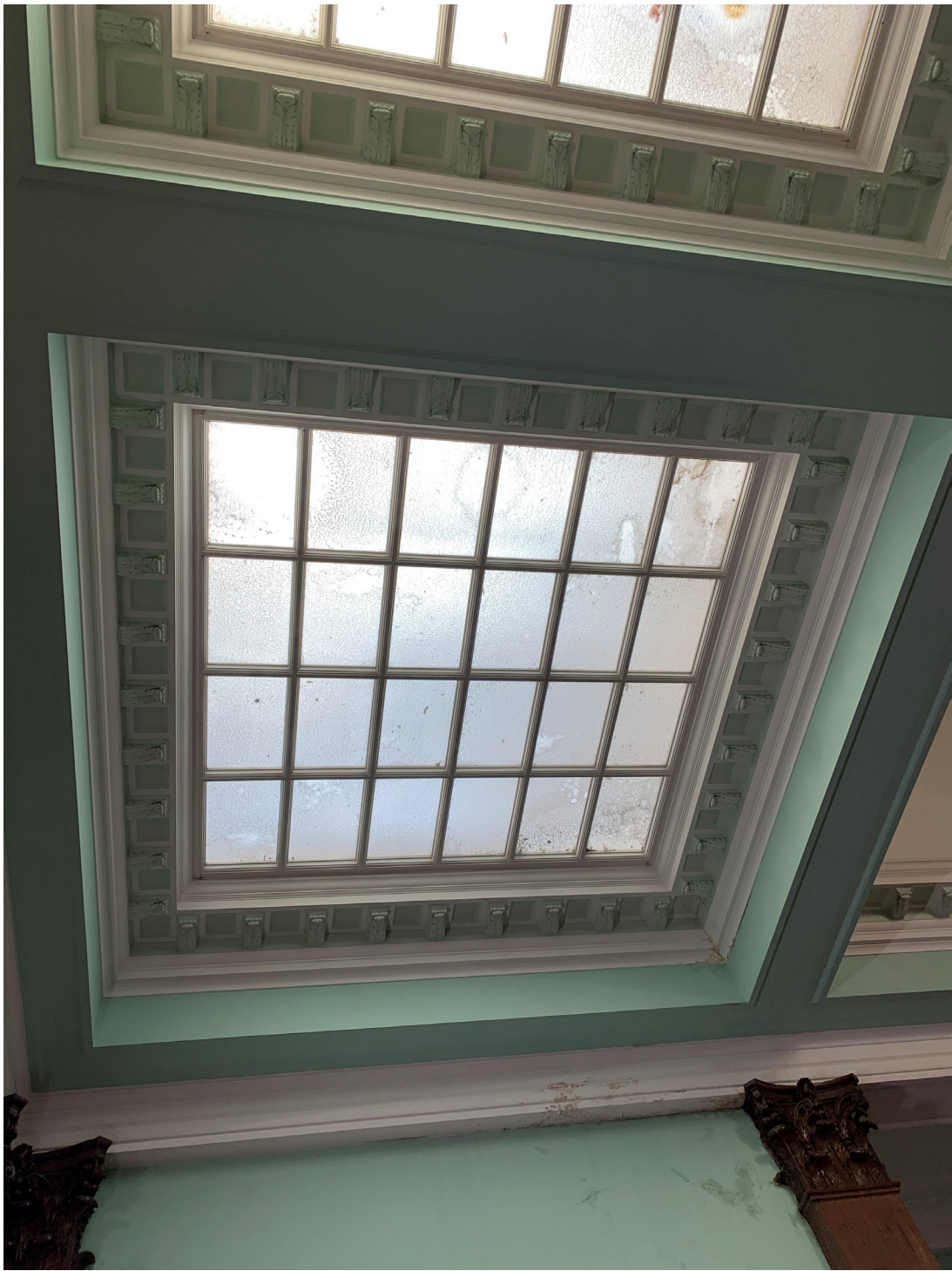
Existing glass diffuser. Small section of 6x4 panes of glass