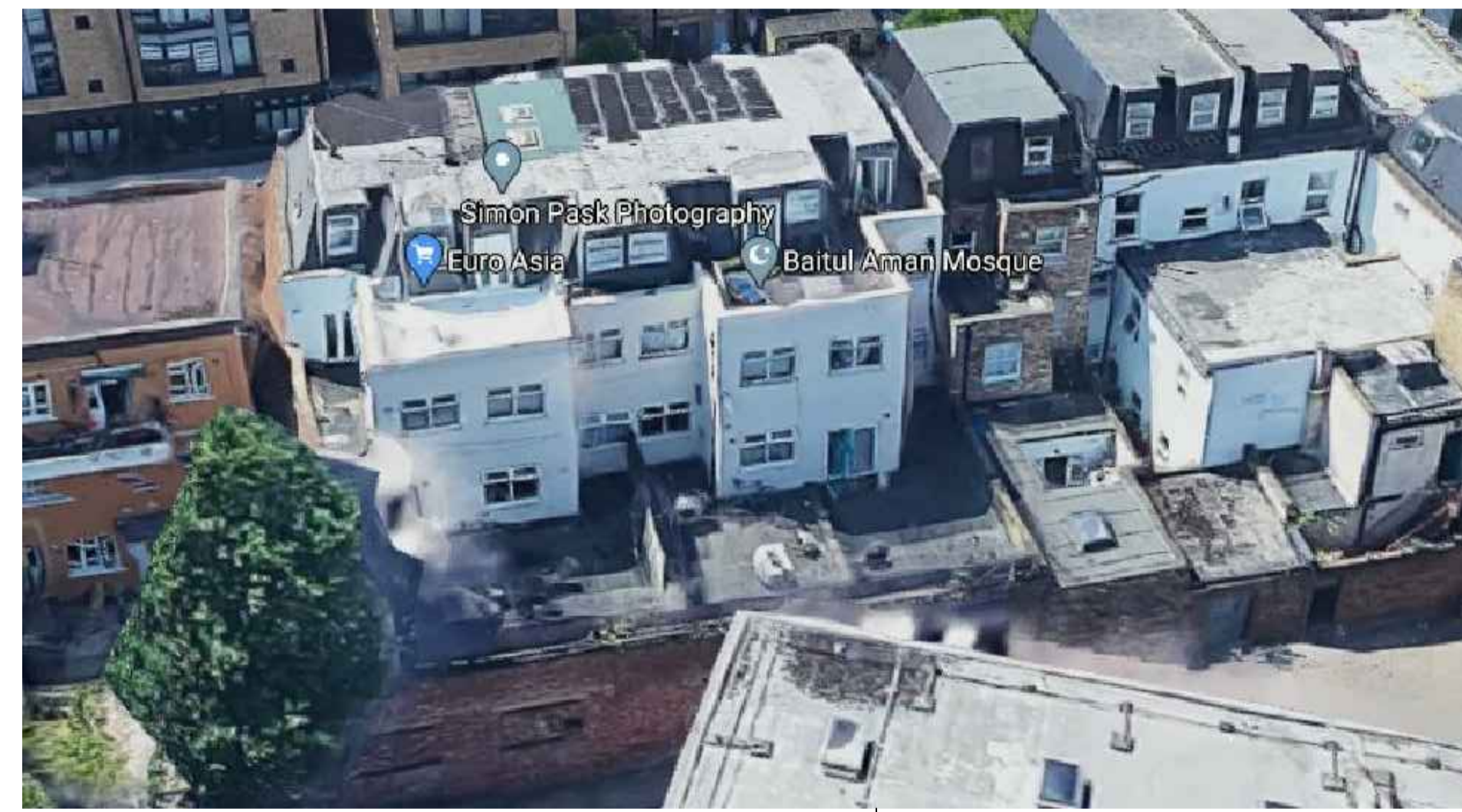
AERIAL VIEW OF REAR