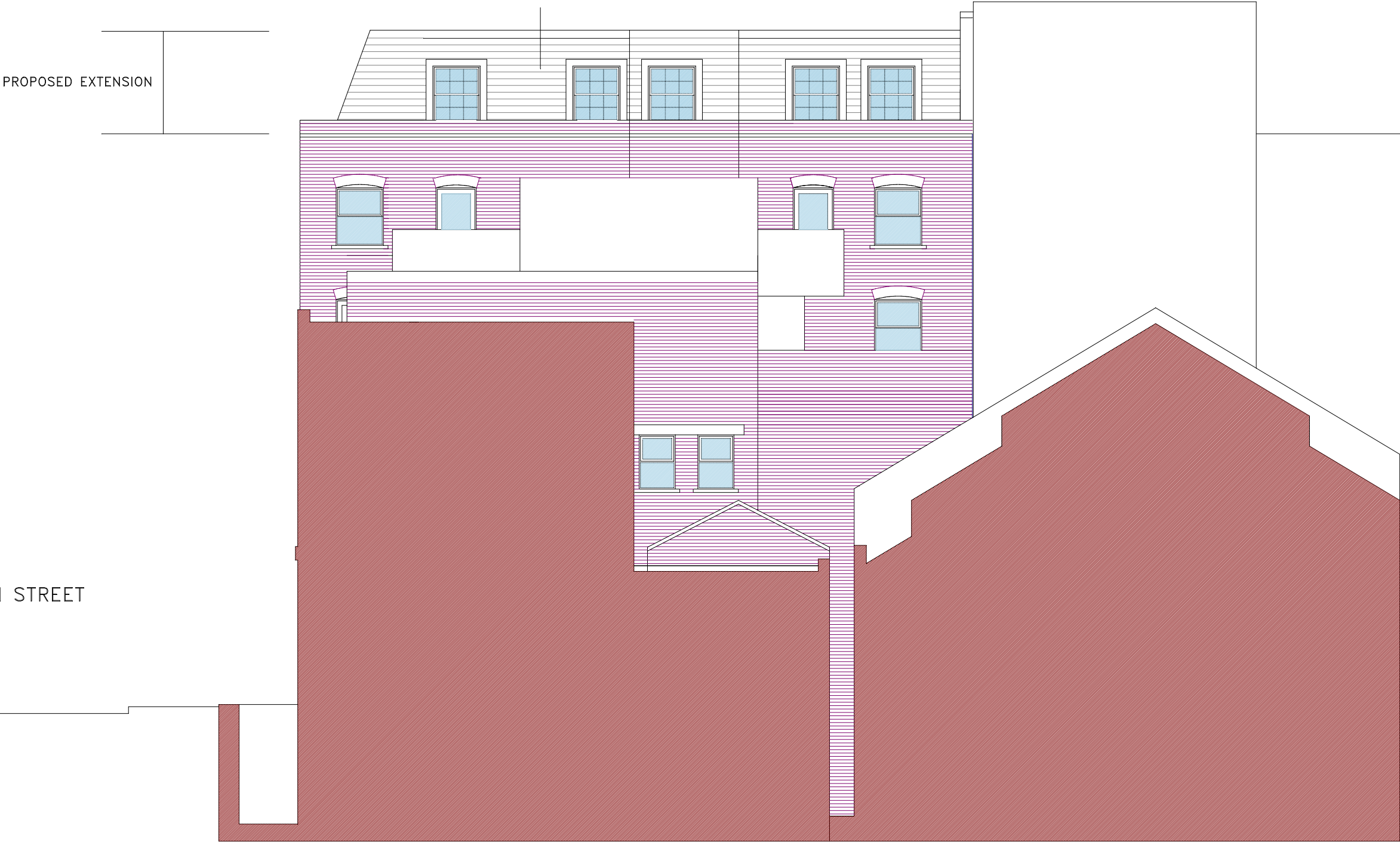
PROPOSED EAST ELEVATION/SECTION D-D

NATURAL SLATE CLADDING TO 70 DEGREE MANSARD WITH LEAD CHEEKS TO DORMERS. TIMBER SASH WINDOWS IN DORMERS