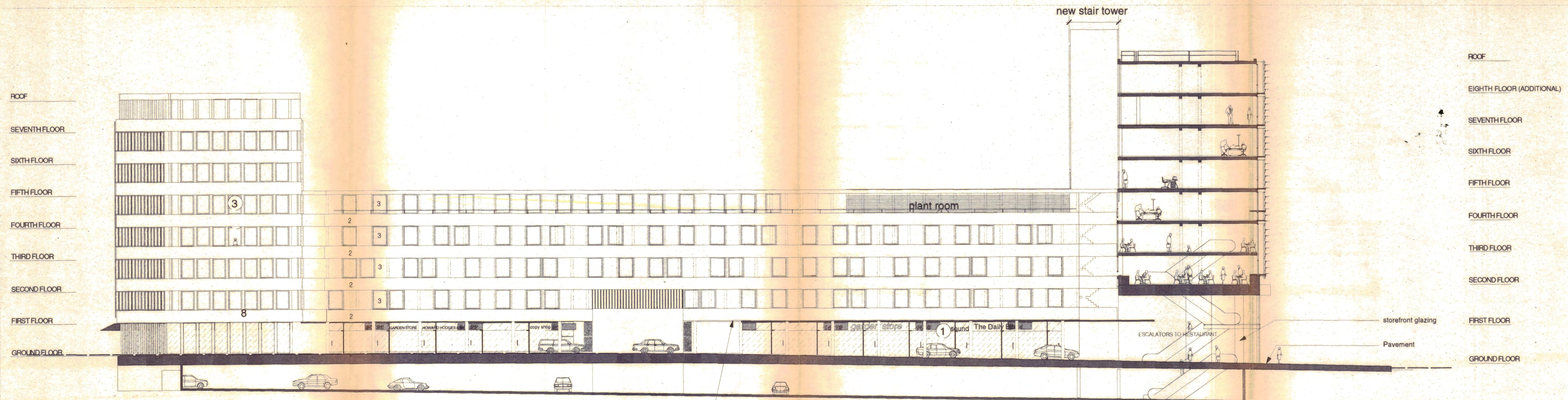
3 WEST ELEVATION 1:200 EAST BLOCK