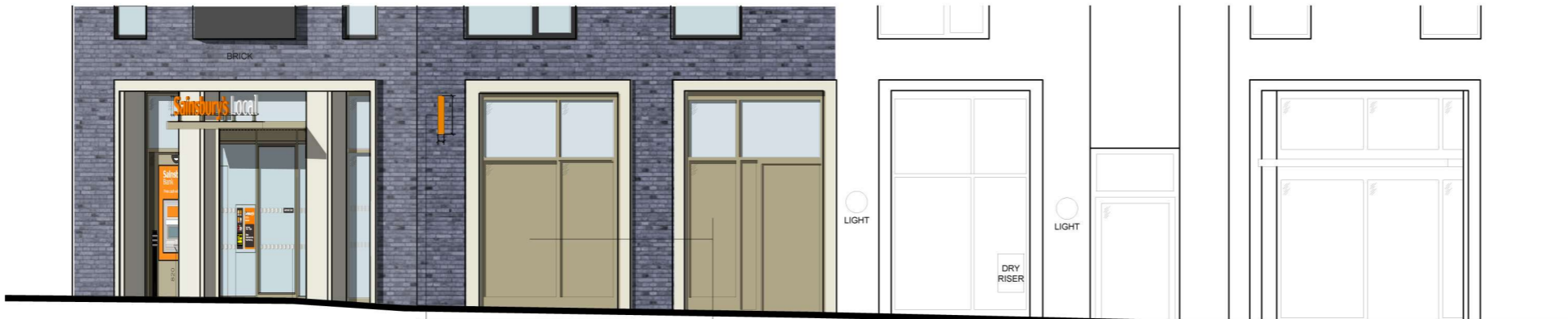
02 PROPOSED NORTH ELEVATION P128229_210 1:100@A3