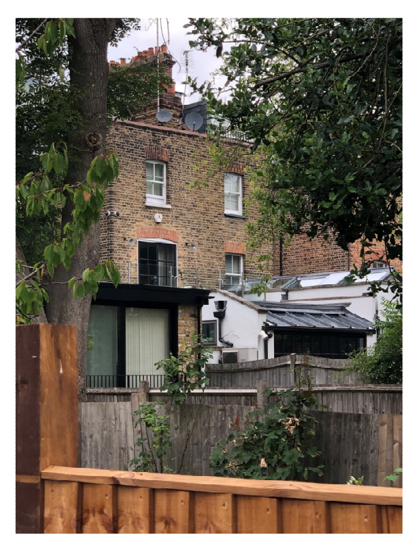
View of similar roof terrace along the terrace