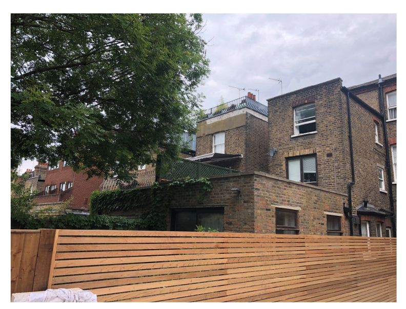
View of similar roof terrace along the terrace