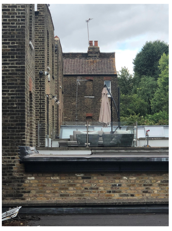
View of similar roof terrace along the terrace