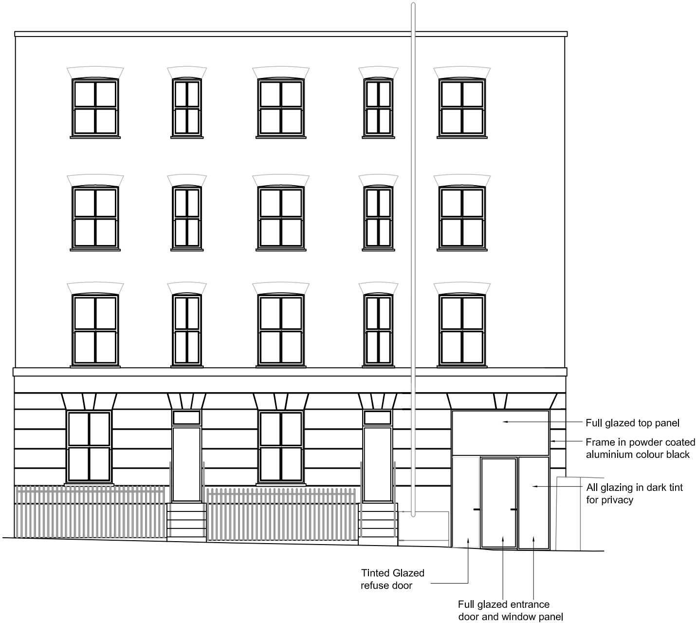
Proposed Front Elevation - 1:100